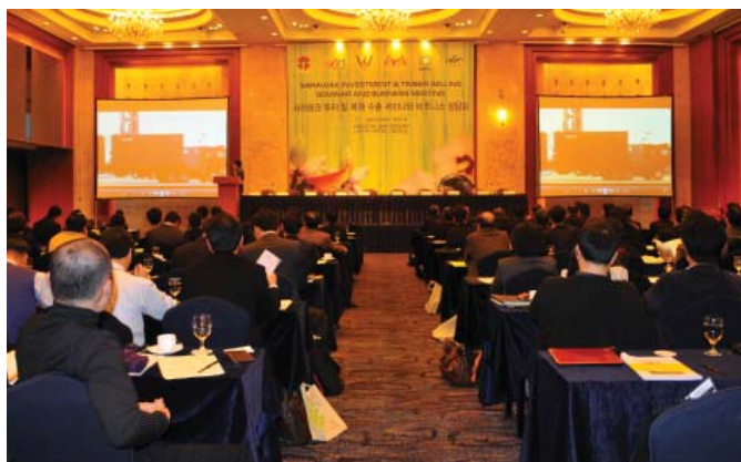
Photo: Seminar in progress