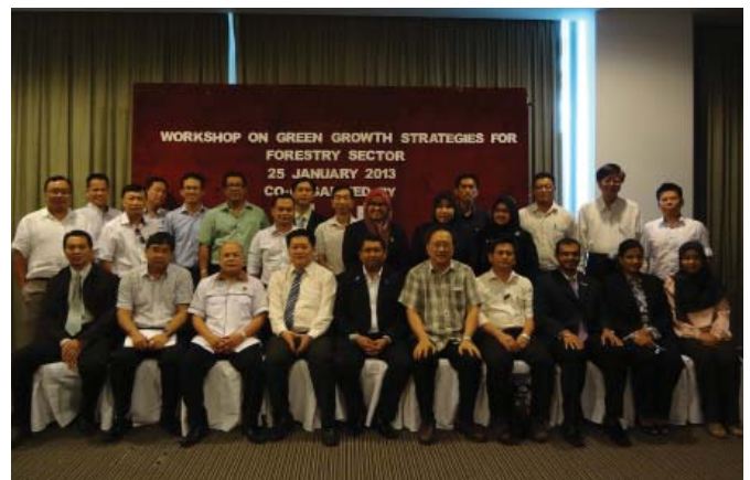
Photo: Workshop participants

The participants deliberated at length the above strategies and the possible entry point projects in relation to green technology for the forestry sector.