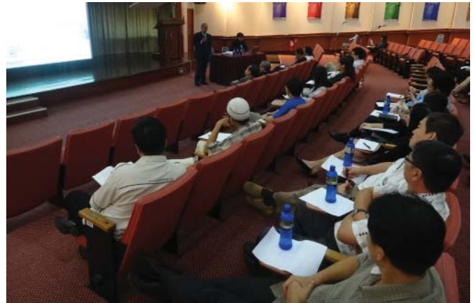
Photo: Briefing in progress

Perbadanan Kemajuan Perusahaan Kayu Sarawak (PUSAKA) telah menganjurkan taklimat Kemaskini Industri pada 14 Januari 2013 di Wisma Sumber Alam, Kuching.