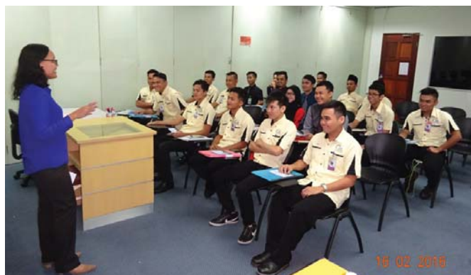
Photo: Students were given a brief introduction to STA and its subsidiary companies.

Both STAM and ILPKS had agreed to select the potential students from the June 2015 intake based on their