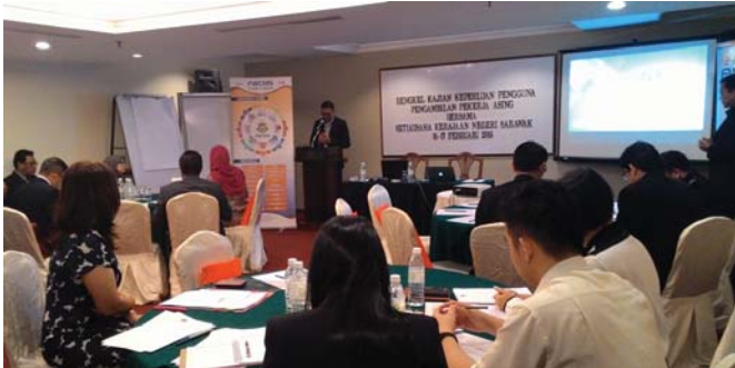
Photo: Workshop in progress

A Workshop on The Needs to Recruit Foreign Workers in Sarawak was organised by the Ministry of Home Affairs, Immigration Affairs Division from 16 to 17 February 2016 at Merdeka Palace Hotel & Suites, Kuching.