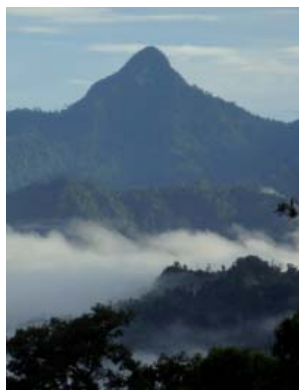
Bukit Tasu at Raya Balleh, Putai, Kapit