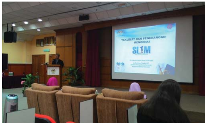
Photo: Seminar in progress

The Gazettes can be downloaded from STA's website at www.sta.org.my .