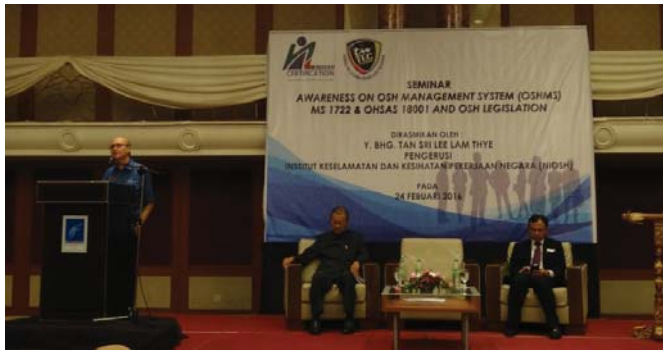
Photo: Seminar in progress

NIOSH Certification Sdn Bhd in collaboration with TM TEC Academy (M) Sdn Bhd organised a Seminar on Awareness on Occupational Safety and Health Management System MS1722:2011 and Occupational Health and Safety Management Systems OHSAS 18001:2007 on 24 February 2016 at Riverside Majestic Hotel, Kuching. The Seminar was attended by approximately 120 participants from Government agencies and private sectors.