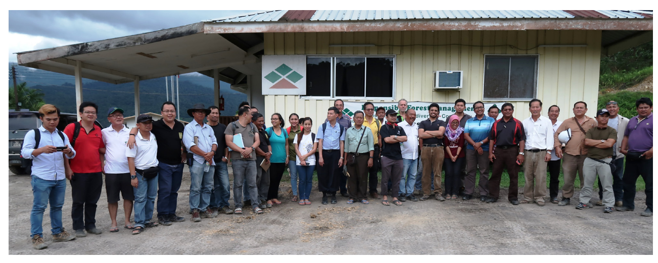
Group photo during the stage 2 audit for Ulu Trusan FMU