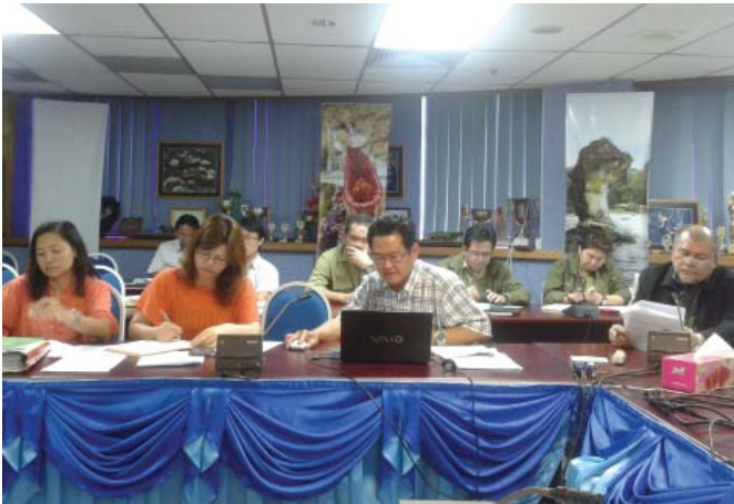
Photo: Meeting in progress