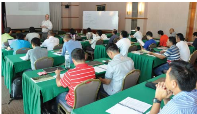
Photo: Briefing in progress

With the amendments made to Section 54B of the Forests Ordinance, the Sarawak State Government will phase in trained workforce for the entire forest industry soon. As part of this drive towards a properly trained workforce for better management of our forests, it is recommended that each logging contractor have "Sustainable Forestry Personnel" to oversee all forest operations in accordance with the laws and guidelines set for sustainable forest management.