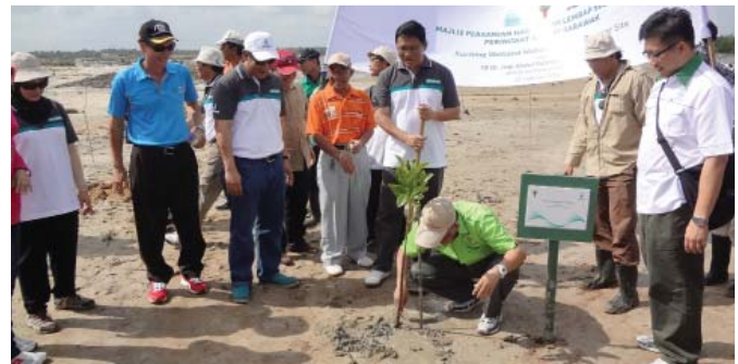
Photo: Director of Forests planting a mangrove tree