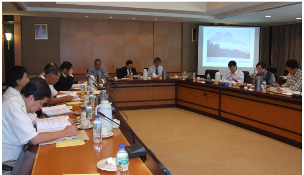
Picture: The 60 th Council Meeting in progress

Four new applications for memberships were approved by the Council and are placed as Associate Members. ❁