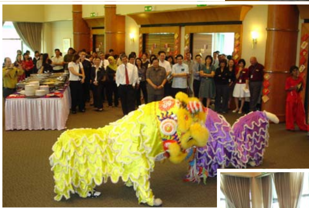
Left: Lion dance performance