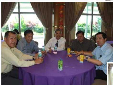
Above and Right: Some of the guests at the STA Chinese New Year Open Office