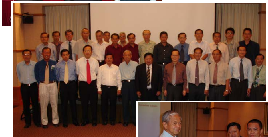
Above: Group photo with representatives of the various schools and members of the Board