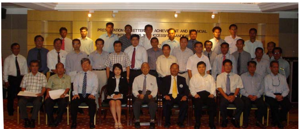
Below: Group photo of the successful candidates with the STA Vice-Chairman, Honorary Secretary and Council Members