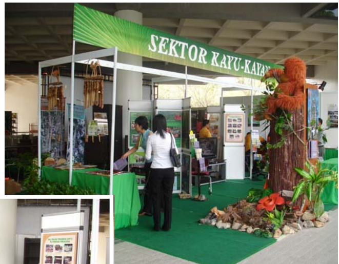
Below: Some of the exhibits at the booth