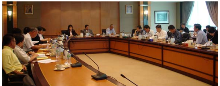
Picture: Meeting in progress

The Council also resolved to fix the date of the Annual General Meeting of the Association as Monday, 31 March 2008 and since this is an election year; the Council appointed five Election Committee Members including the Chairman and the Honorary Secretary of the Association to carry out the duties provided under Article 8(a) of the M&A. The effective date for the appointment of the Election Committee for carrying out its functions stipulated in Article 8(a)(i) of the Articles of Association of the Association is 3 March 2008. ❁