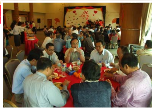
Below: Guests mingling with each other and enjoying the Chinese New Year atmosphere at the STA Open House

Acara tahunan Persatuan iaitu Pejabat Terbuka Tahun Baru Cina 2008 telah diadakan pada 14 Februari di Wisma STA, Kuching sebagai tanda penghargaan kepada rakan-rakan sekerja yang bekerja rapat dengan Persatuan sepanjang tahun lepas.