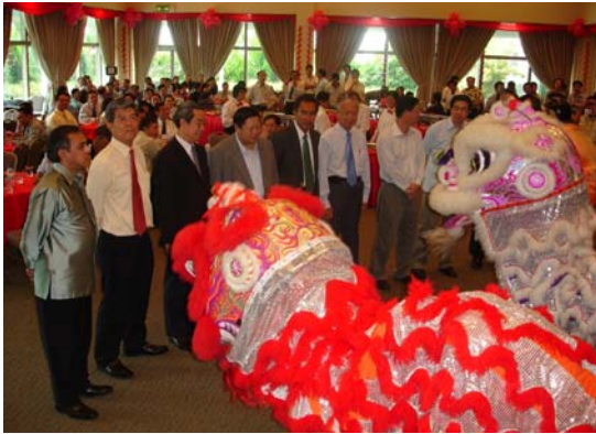
Above: The lions paying their respects to the Chairman of STA and his invited guests

Around 300 guests from the various government agencies and the private sector attended this gathering. They were entertained by a lion dance and music performance by a Chinese traditional orchestra. ❁