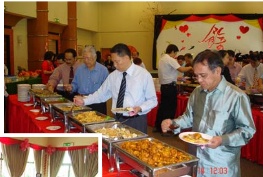
Right: The sumptuous layout for the guests