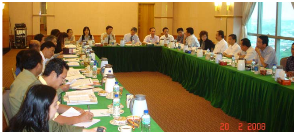
Picture: Meeting in progress

The log fisher system is being adopted by one of the FMUs for timber harvesting. This system is said to be more environmentally friendly for timber harvesting. To learn more about this system, a presentation will be organised in Sibul, tentatively in April 2008. This will then be followed by a field trip to the site where the machine is being used. ❁