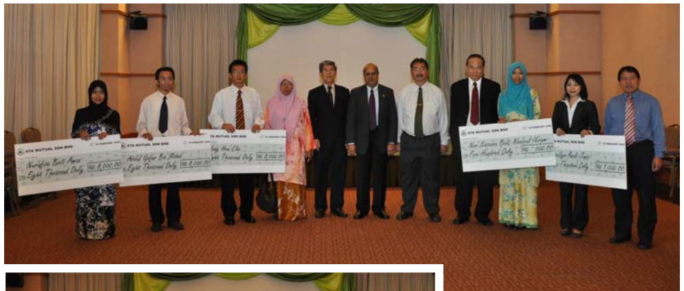
Above: The recipients of the STA Scholarships and STA Prizes