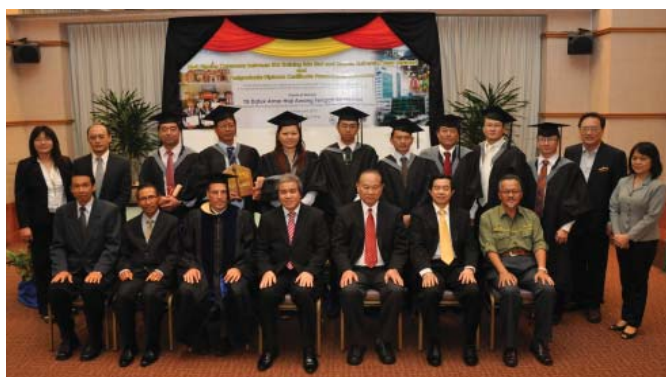
Photo: Group photo