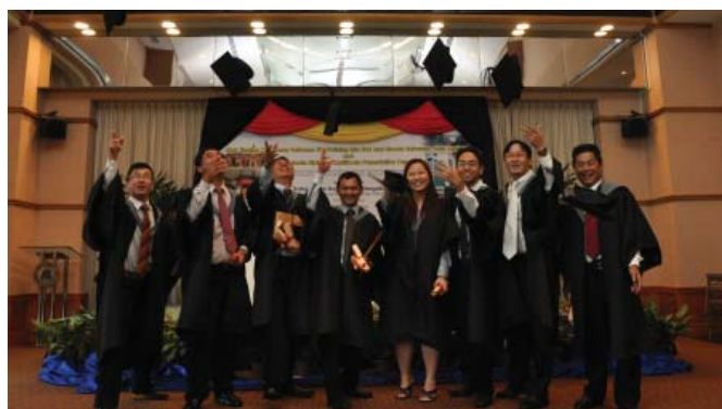
Photo: Graduating students