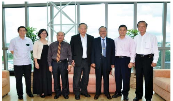
Photo: STAM Board of Honorary Advisers

Menurut Artikel 93A Memorandum dan Artikel Persatuan STA Mutual Sdn Bhd (STAM), Lembaga Penasihat Kehormat telah ditubuhkan untuk membimbing dan membantu Syarikat mengenai perkara-perkara seperti pemberian biasiswa dan mempertimbangkan serta memberikan nasihat tentang projek-projek tanggungjawab sosial korporat (CSR) dan derma kepada pertubuhan kebajikan mengikut matlamatnya seperti yang dinyatakan dalam Memorandum dan Artikel Persatuan bagi STAM.