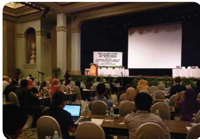
Photo: Workshop in progress

工作坊共呈现18张论文。作为马来西亚执行机构代表，NRE联同马来西亚UNDP已在2011年10月开始进行REDD+准备计划。这项计划估计会在2013年10月完成。该计划关键成果领域旨于通过持续性环境管理改善生活素质。