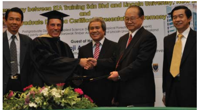
Photo: Exchanging of MoU