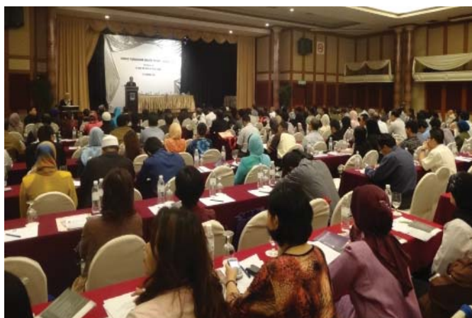
Photo: Seminar in progress

The Sarawak Furniture Industry Development Seminar 2012: Transformation of Raw Materials, Innovation, Quality and Design of Furniture towards the Global Market was held from 14 to 16 February 2012 at Riverside Majestic Hotel in Kuching. The three-day seminar was jointly organised by the Forest Research Institute Malaysia (FRIM), Ministry of Natural Resources and Environment (NRE), Sarawak Timber Industry Development Corporation (STIDC) and Universiti Malaysia Sarawak (UNIMAS).