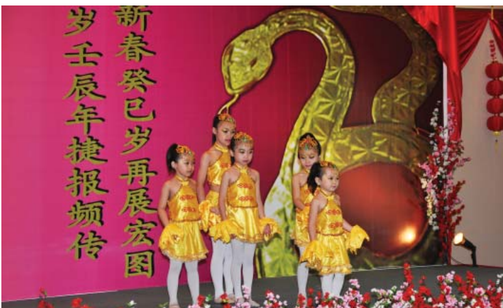
Photo: Dance Performance