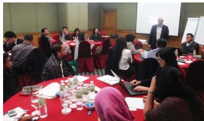
Photo: Workshop participants

The participants were also divided into groups to discuss the three components in detail. The Workshop ended with a plenary session where all the participants were grouped together to listen to the presentation of the discussions from each group.