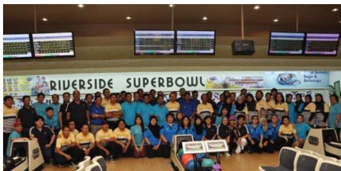
Photo: Group photo for Bowling Tournament