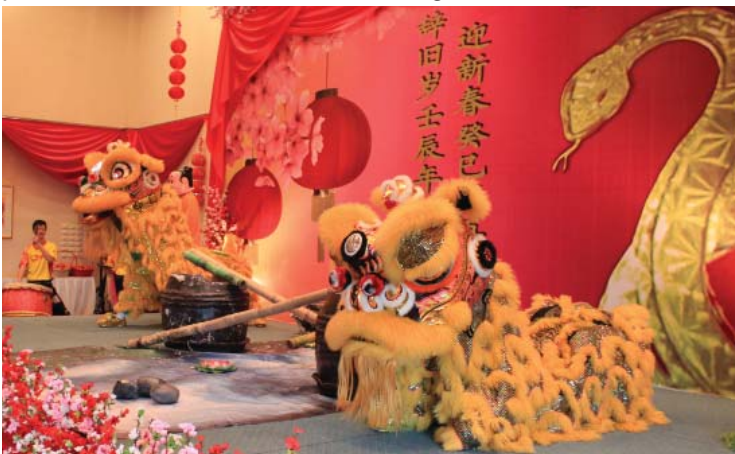
Photo: Lion Dance Performance

About two hundred and forty (240) invited guests from government agencies and departments and as well as business associates attended the function. The event started with a lion dance performance, followed by a symbolic tossing of 'Yee Sang' by STA Council members and invited guests to mark the start of the luncheon. There were also dance performances to entertain the invited guests.