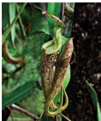
Nepenthes stenophylla Habitat: Kerangas and mossy montane forests