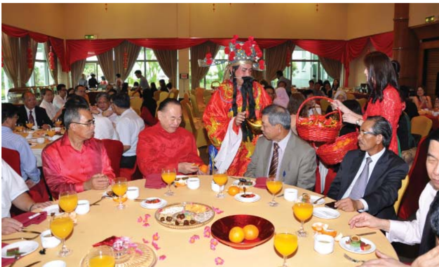
Photo: God of Fortune distributing fortune cookies to guests