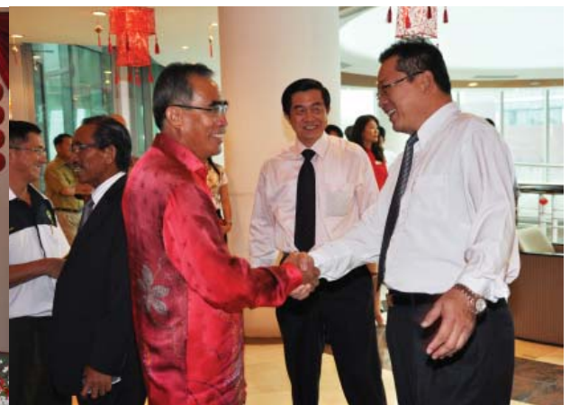
Photo: Arrival of Invited Guests