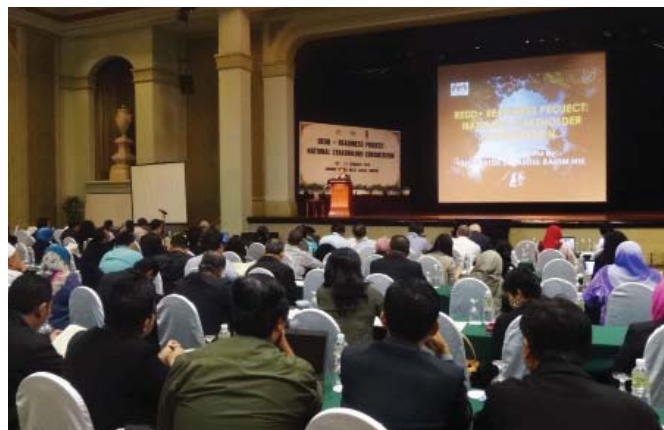
Photo: Workshop in progress

Participants in this Workshop were divided into groups to discuss on the objectives and tasks of financing