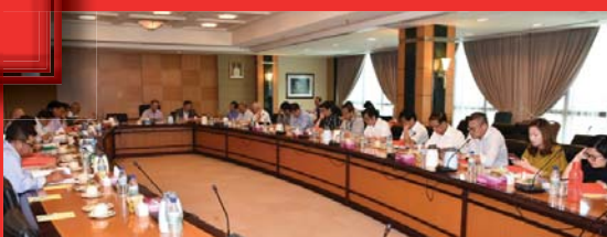
STA Council Meeting No 3/2016, Wisma STA, Kuching, 7 October 2016