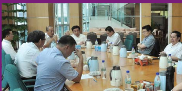
STA Panel Products Category Meeting and STA Panel Products Committee Meeting No 2/2016, Wisma STA, Kuching, 13 June 2016