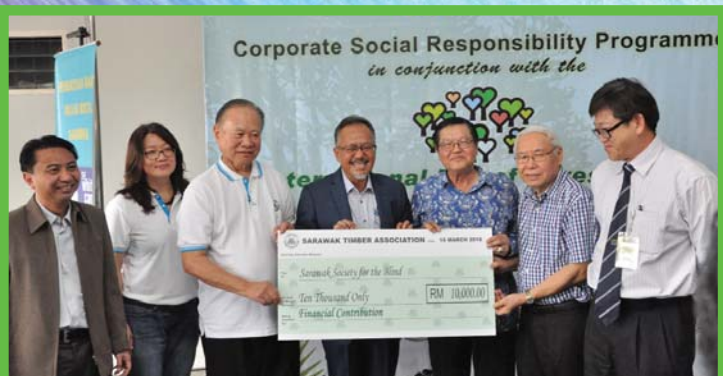
Corporate Social Responsibility Programme, Sarawak Society for the Blind (Top) and Rumah Seri Kenangan (Bottom), Kuching, 16 March 2016