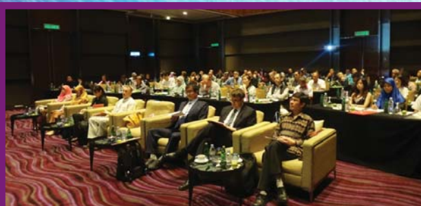
26 th Illegal Logging Update and Stakeholder Consultation Meeting, The Crystal, Royal Victoria Docks, London, 16 - 17 June 2016