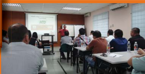
Forum on High Temperature Drying Technology, Kota Sentosa, Kuching, 5 May 2016