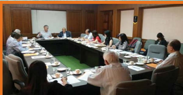
Malaysian Timber Association Executive Committee Meeting No 2/2016, Kota Kinabalu, Sabah, 10 May 2016