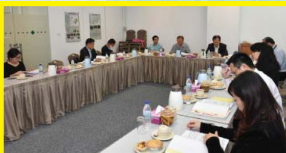
STA Board of Honorary Advisers Meeting No 2/2016, Wisma STA, Kuching, 20 July 2016