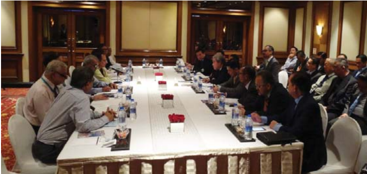
Photo: Dialogue between Sarawak delegation and members of Bombay Timber Merchants Association