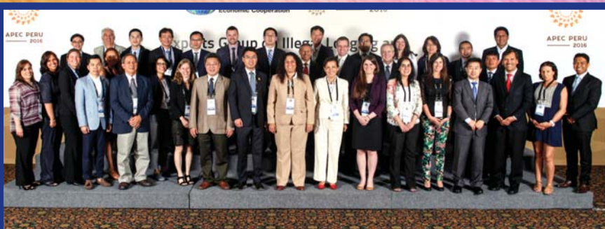
9 th Asia-Pacific Economic Cooperation Experts Group on Illegal Logging and Associated Trade Meeting, Lima, Peru, 20-21 February 2016