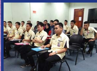
Interview Session with Students from Institut Latihan Perindustrian Kota Samarahan, Kota Samarahan 16 February 2016