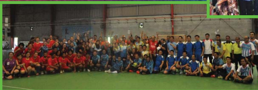
International Day of Forests 2016, March 2016