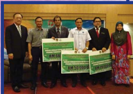
Presentation of Cheques to Schools, Parkcity Everly Hotel, Miri, 23 February 2016