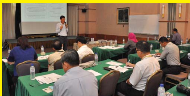
Discussion cum Training Session on the MC&I FP.v2, Wisma STA, Kuching, 7 January 2016