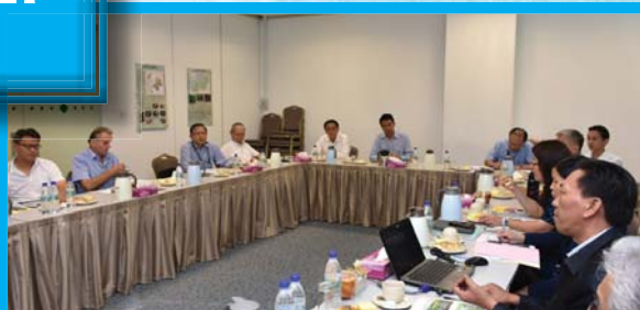
STA Forest Plantation Committee Meeting No 3/2016, Wisma STA, Kuching, 1 September 2016