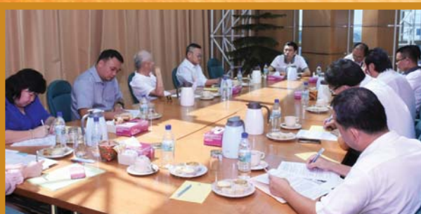
STA Panel Products Committee Meeting No 3/2016, Wisma STA, Kuching, 18 August 2016