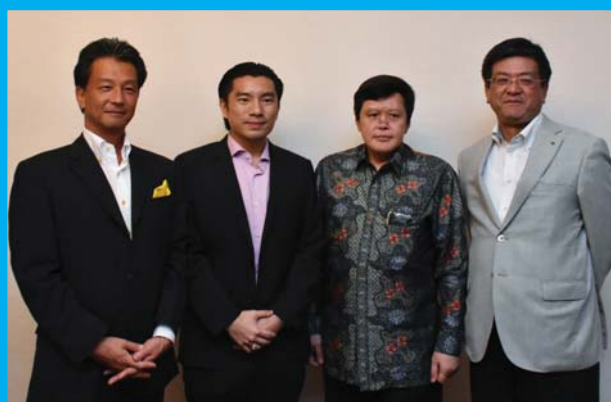
19 th Tri-Nations Joint Meeting of JLIA/JPMA/APKINDO/STIA/STA, Wisma STA, Kuching, 19 September 2016