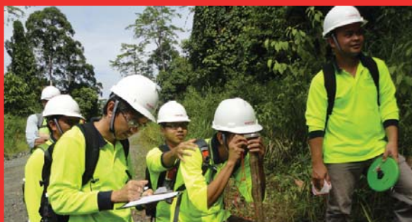
Postgraduate Diploma in Applied Science (Sustainable Tropical Forest Management/Sustainable Tropical Plantation Management) – Communities and the Forest Industry, Deramakot Forest Reserve, Sandakan, Sabah, 8 - 14 October 2016