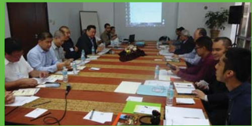
Trade and Market Study Mission to the Philippines – Builder's Joinery & Carpentry Articles, Mouldings as well as Furniture Sector, Manila, Philippines, 9 - 13 March 2016