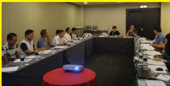
STA Sawmilling Category Meeting No 1/2016 and Committee Meeting No 1/2016, Tanahmas Hotel, Sibul, 13 July 2016