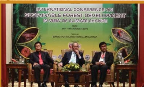
International Conference on Sustainable Forest Development in View of Climate Change 2016, Hotel Bangi-Putrajaya, Selangor, 8 - 11 August 2016