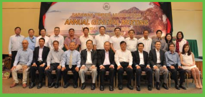
STA Council Meeting No 2-2016, Wisma STA, Kuching, 28 March 2016