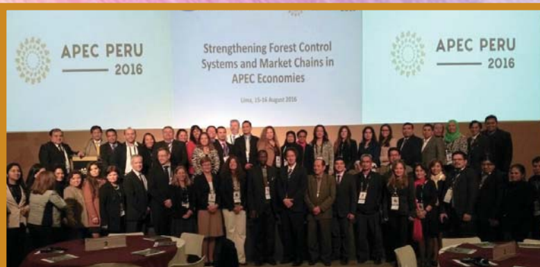
The Asia-Pacific Economic Cooperation Experts Group on Illegal Logging and Associated Trade Workshop and Meetings, Lima Convention Centre in Lima, Peru, 15 - 19 August 2016