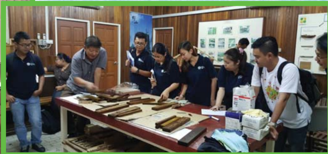
Postgraduate Diploma in Applied Science (Sustainable Tropical Forest Management/Sustainable Tropical Plantation Management) - Log Grades and Wood Quality, Wisma STA, Kuching, 5 - 11 March 2016