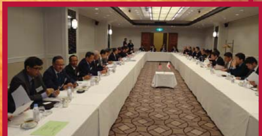
Sarawak Delegation to Japan, Tokyo, Japan, 26 April 2016