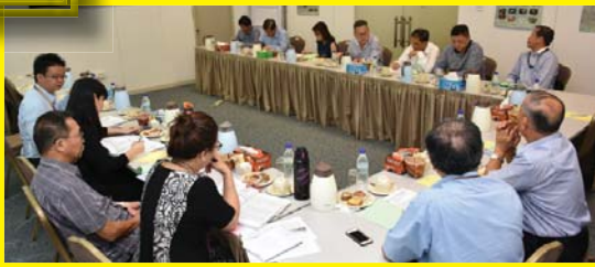
Hill Logging Category and Committee Meeting No 1/2016, Wisma STA, Kuching, 1 July 2016