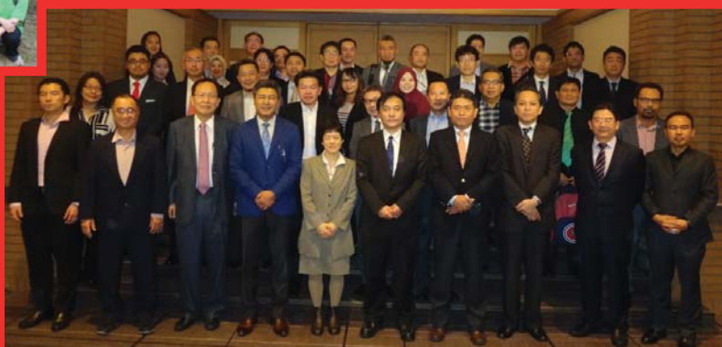
Sarawak Delegation to Promote Sarawak Timber Legality Verification System, Imperial Hotel, Tokyo, Japan, 18 - 19 October 2016