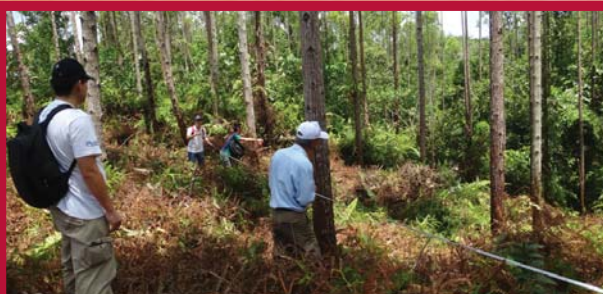
Training Workshop on Statistic, Forest Inventory and Growth Modelling, Bintulu, 25 - 28 April 2016