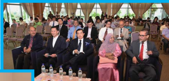
Presentation Ceremony of Financial Contributions for Education, STA and Daiken Scholarships, and Signing Ceremony of the Educational Financial Assistance Agreement with Institut Latihan Perindustrian Kota Samarahan and Institut Kemahiran Mara, Wisma STA, Kuching, 8 September 2016