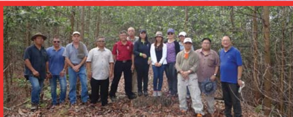
2 nd Series of Discussion cum Field Visit to Members' Forest Plantations and Mill, Bintulu, 17 - 20 October 2016