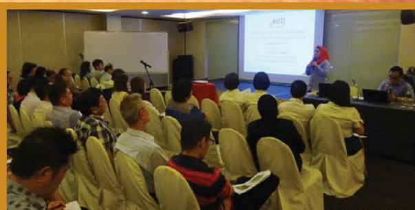
Dialogue Session between the Ministry of International Trade and Industry and Members of Sarawak Timber Association, Tanahmas Hotel, Sibn, 30 August 2016