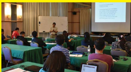
Postgraduate Diploma in Applied Science (Sustainable Tropical Forest Management/Sustainable Tropical Plantation Management) – Communities and the Forest Industry, Wisma STA, Kuching, 16 - 22 July 2016