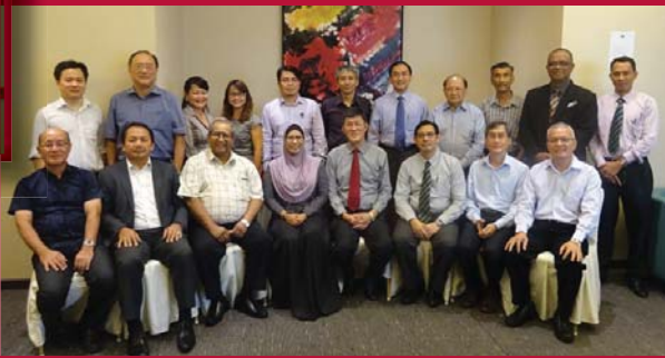
First Meeting of the Standards Review Committee for the Review of MC&I (Natural Forest), Kuala Lumpur, 12 - 14 April 2016