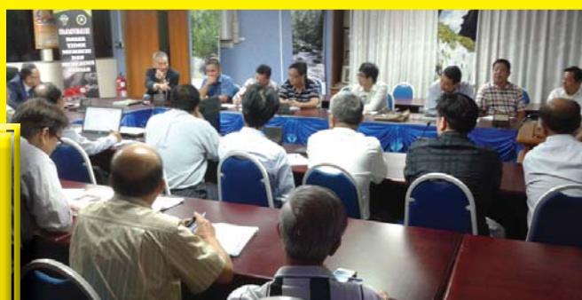
Quarterly Meeting with Licensees for Planted Forest No 1/2016, Wisma Sumber Alam, Kuching, 4 January 2016