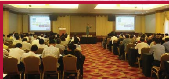
Consultation Workshop with the Timber Industry on the Revised Sarawak Timber Legality Verification System, Sibu, 12 April 2016