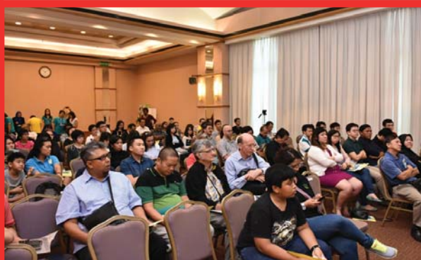
STA Tea Talk - Medicinal and Aromatic Essential Oils from Sarawak's Indigenous Plants, Wisma STA, Kuching, 29 October 2016