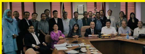
Japan Lumber Inspection and Research Association's Visit to Sarawak, Kuching, 18 - 21 July 2016