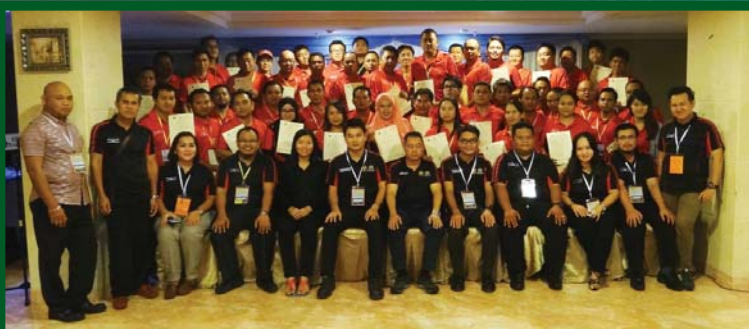
5 th Series of Campaign on Occupational Safety and Health for the Timber Industry in Sarawak, Kemena Plaza Hotel, Bintulu, 22 - 24 November 2016