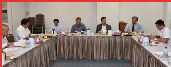
STA Enterprises Sdn Bhd Board of Directors Meeting No 2/2016, Wisma STA, Kuching, 6 October 2016