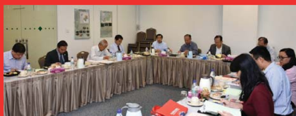
STA Board of Honorary Advisers Meeting No 3/2016, Wisma STA, Kuching, 6 October 2016