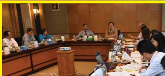
STA Permanent Council Meeting No 1/2016, Wisma STA, Kuching, 25 July 2016