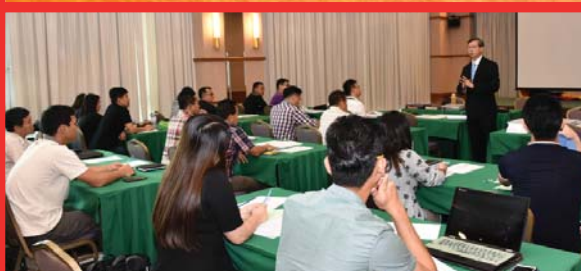
2 nd Environmental Compliance Audit Training Course Part 2, Wisma STA, Kuching, 26 - 30 October 2016