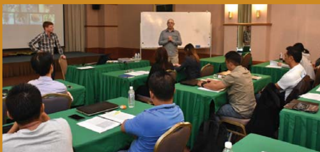
Postgraduate Diploma in Applied Science (Sustainable Tropical Forest Management/Sustainable Tropical Plantation Management) – Plantation Forest Protection and Sustainability, Wisma STA, Kuching, 20 - 26 August 2016