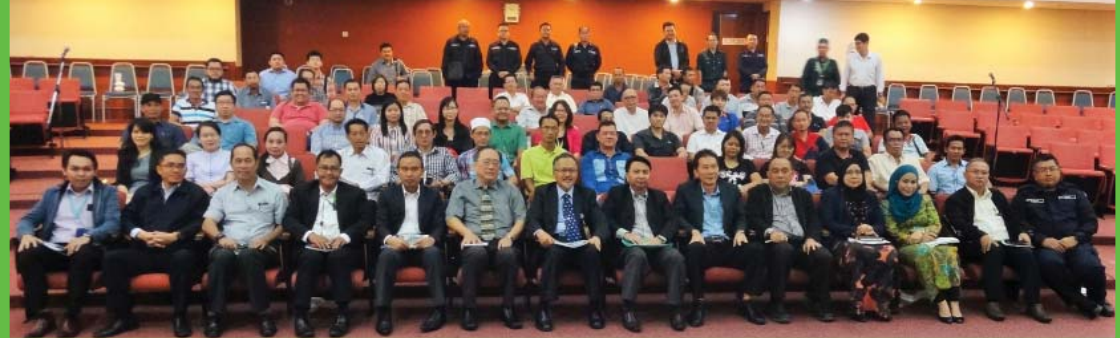
Briefing on the Enforcement on Legal Source of Timber for Wood Based Mills, March 2016