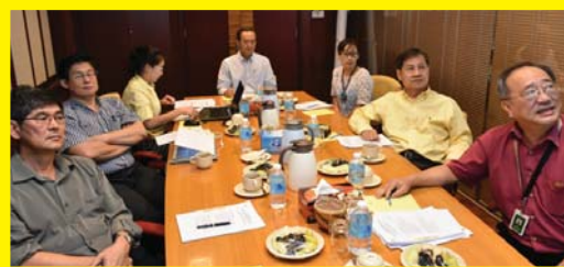
STA Furniture & Other Woodworking Category Meeting No 1/2016 and Committee Meeting No 1/2016, Wisma STA, Kuching, 12 July 2016