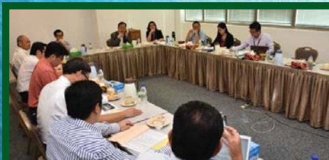
STA Certification Committee Meeting No 1/2016, Wisma STA, Kuching, 15 November 2016