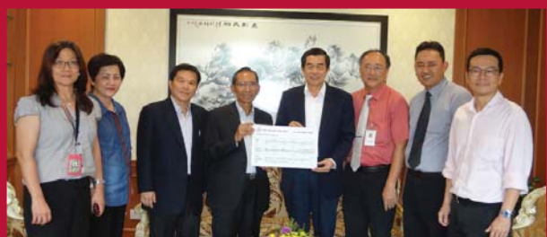
Schools in the Limbang and Lawas Districts Get a Helping Hand from Sarawak Timber Industry Development Corporation and Sarawak Timber Association, Sarawak, 20 and 25 April 2016