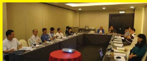
STA Timber Products Marketing Category Meeting No 1/2016 and Committee Meeting No 1/2016, Tanahmas Hotel, Sibul, 13 July 2016