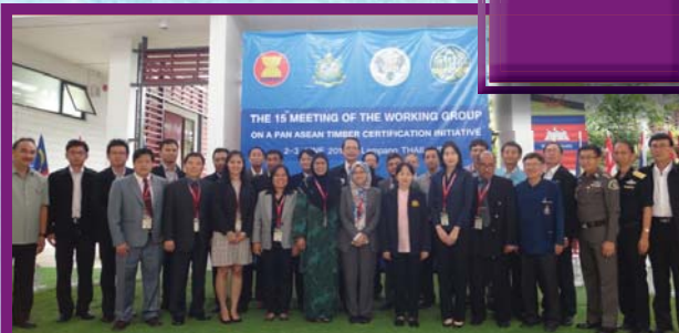
The 15 th Meeting of the Working Group on a Pan ASEAN Timber Certification Initiative, Thai Elephant Conservation Center, Lampang Province, Thailand, 2 - 3 June 2016