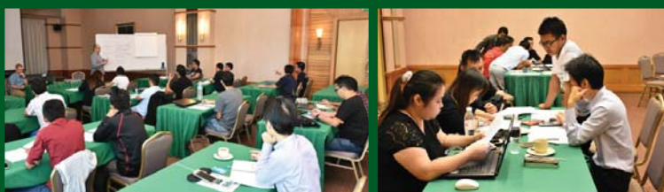
Postgraduate Diploma in Applied Science (Sustainable Tropical Forest Management/Sustainable Tropical Plantation Management) – Harvest Planning, Wisma STA, Kuching, 26 November 2016 - 2 December 2016