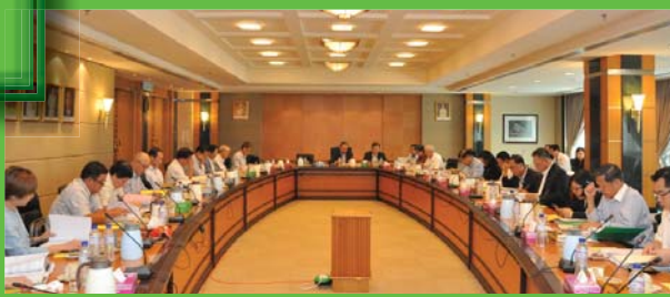
STA Council Meeting No 1-2016, Wisma STA, Kuching, 1 March 2016