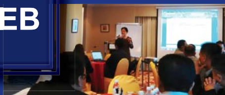
Workshop on Developing Standard and Compliance Checklist for Sarawak Timber Legality Verification System, Riverside Majestic Hotel, Kuching, 1-2 February 2016