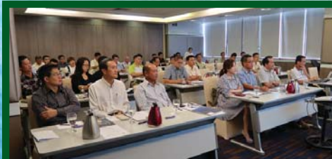
Briefing by Sawmill Machinery Manufacturers and Fact Finding Trip, Bintulu, 14 November 2016