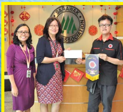
Financial Assistance to PIBAKAT, Wisma STA, Kuching, 27 January 2016