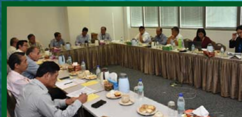
STA Forest Plantation Category Meeting No 2/2016 and STA Forest Plantation Committee Meeting No 4/2016, Wisma STA, Kuching, 25 November 2016