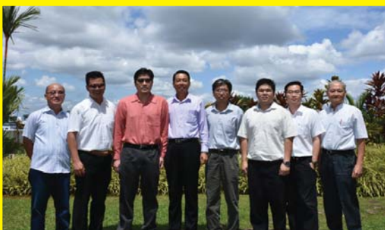
Task Force on Forest Management Certification, Wisma STA, Kuching, 15 July 2016