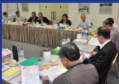
STA Board of Honorary Advisers Meeting No 1/2016, Wisma STA , Kuching, 29 February 2016