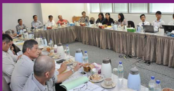
STA Forest Plantation Category Meeting No 1/2016 and STA Forest Plantation Committee Meeting No 2/2016, Wisma STA, Kuching, 14 June 2016