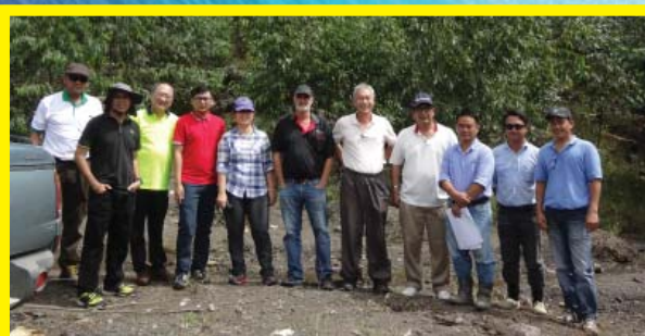
Discussions cum Field Visits to Members' Forest Plantations Programme, Miri, 26 - 28 July 2016