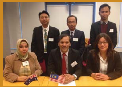
Malaysian Delegation at The 7 th Forestry and Timber Technical Working Group Meeting, Canberra, Australia, 4 August 2016