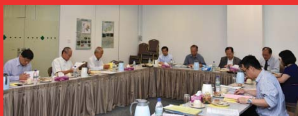
STA Training Sdn Bhd Board of Directors Meeting No 2/2016, Wisma STA, Kuching, 6 October 2016