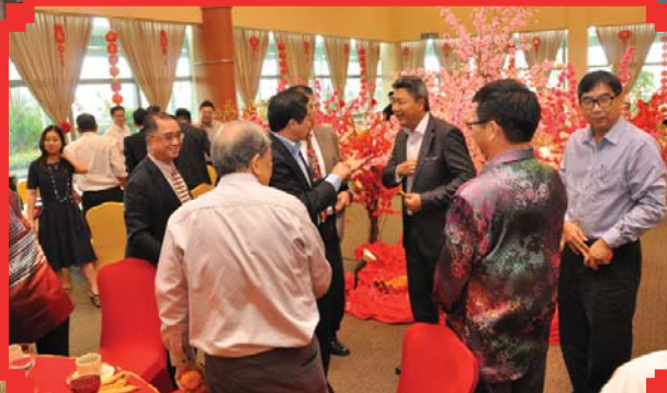
Chinese New Year Open Office, Wisma STA , Kuching, 18 February 2016