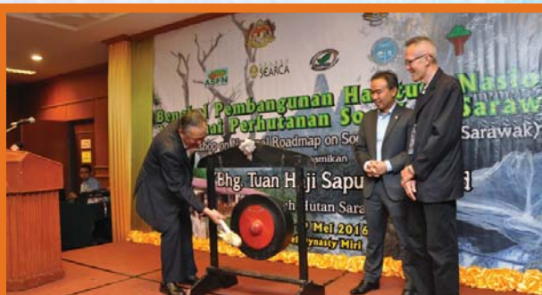
Workshop on National Roadmap on Social Forestry in Sarawak, Dynasty Hotel, Miri, 17 - 19 May 2016