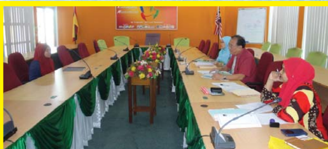
Panel Interview for the Institut Kemahiran Mara Student Awards, IKM, Kuching, 18 January 2016