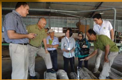
SARAWAK FORESTRY Corporation Wood Properties Workshop, Timber Technical Centre, Kuching, 1 - 2 August 2016