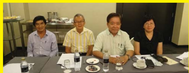
STA Moulding Category Meeting No 1/2016 and Committee Meeting No 1/2016, Tanahmas Hotel, Sibul, 13 July 2016