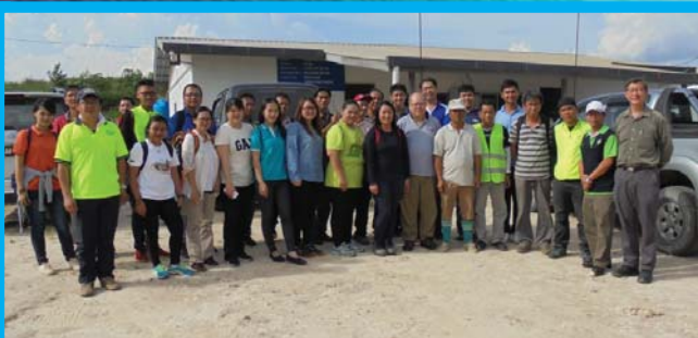
2 nd Environmental Compliance Audit Training Course Part 1, Kuching, 26 - 30 September 2016