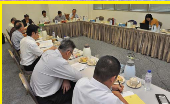
STA Forest Plantation Committee Meeting No 1/2016, Wisma STA, Kuching, 8 January 2016