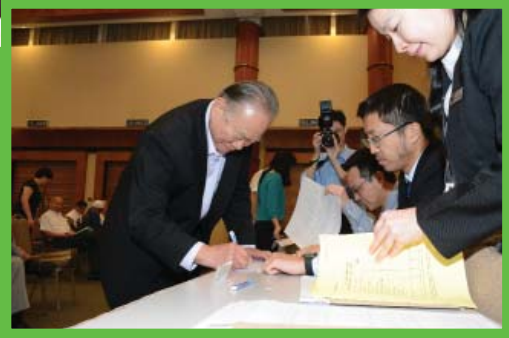
STA Annual General Meeting, Wisma STA, Kuching, 28 March 2016