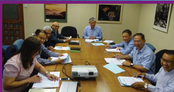
The Malaysian Timber Association Annual General Meeting 2016 , Menara PGRM Kuala Lumpur, 27 June 2016