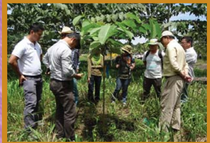
Field Visit to Ta Ann Kelampayan Inter-Planting Project in LPF Peatland Oil Palm Plantation Naman, Sibn, 4 August 2016