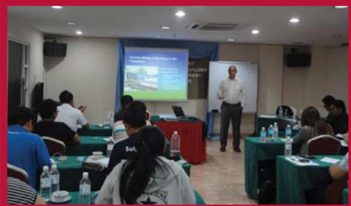
Postgraduate Diploma in Applied Science (Sustainable Tropical Forest Management/ Sustainable Tropical Plantation Management) – Forest Engineering, Kemena Plaza Hotel, Bintulu, 16 - 22 April 2016