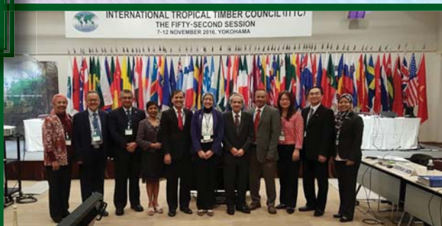
52 nd Session of the International Tropical Timber Council, Yokohama, Japan, 7 - 12 November 2016