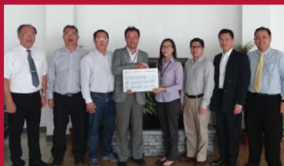
STA and Daiken Scholarship Award, Universiti Malaysia Sarawak (UNIMAS), Kota Samarahan, 19 April 2016