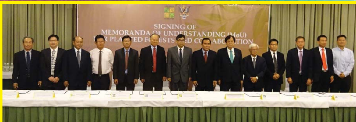
Signing of MoU for Planted Forests Research, RH Hotel, Sibu, 29 January 2016