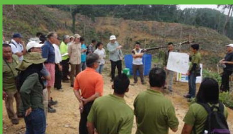
Technical Meeting on Planted Forest Research Programme, Bintulu, 16 - 17 March 2016