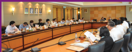
26 November – 82 nd STA Council Meeting