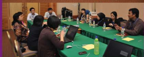
10 to 11 May - 2 nd Series Workshop on International Tropical Timber Organization (ITTO) by Ministry of Plantation Industries and Commodities