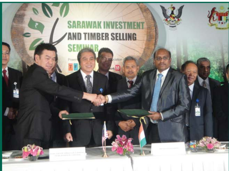
11 to 18 March – Sarawak Investment and Timber Selling Mission to Chennai and Mumbai, India