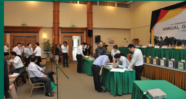
30 March - STA Annual General Meeting