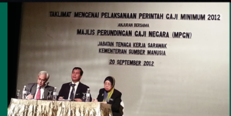
20 September – Briefing on Implementation of Minimum Wage