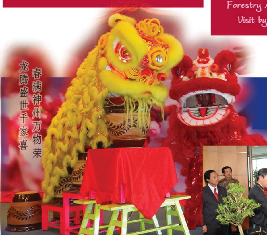
1 February - STA Annual Open Office