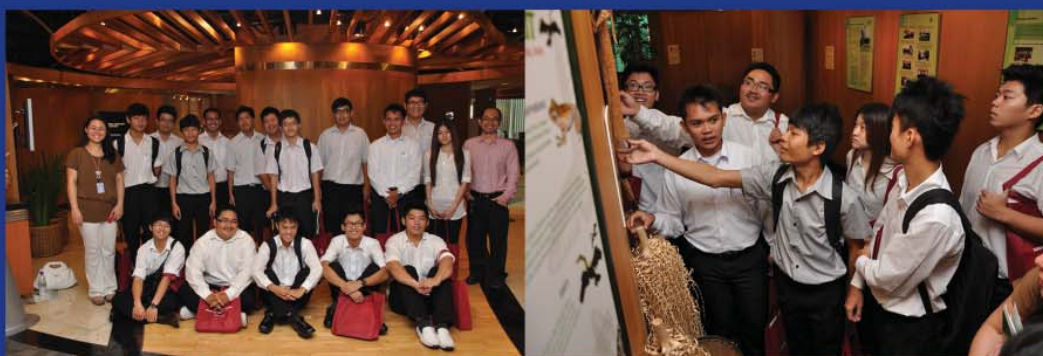
9 August - Educational visit by Sacred Heart School in conjunction with KTS' Young Potential Development Programme for Plantation Management