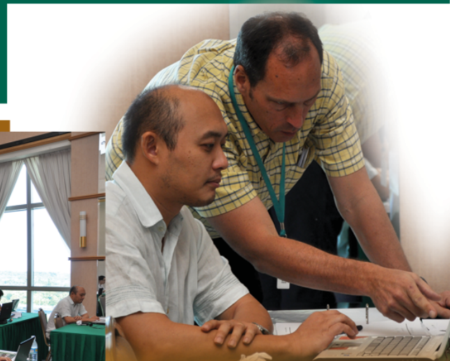
23 April - Postgraduate Diploma in Applied Science Cohort 3