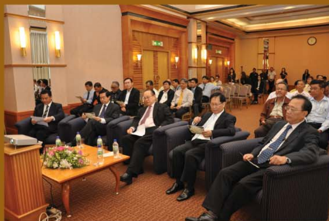
23 April – Presentation Ceremony of Financial Contribution and Daiken & STA Scholarships