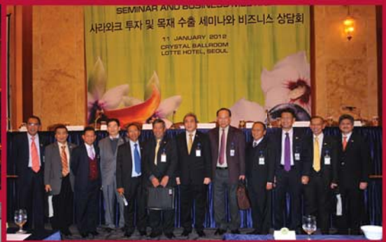
10 to 15 January - Sarawak Investment and Timber Selling Mission to Seoul, Republic of Korea