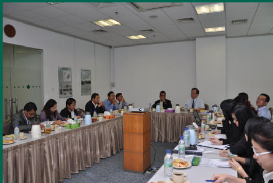
6 March - Briefing on STA's Proposal for Tax Incentive for Forest Plantation Projects