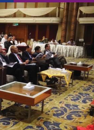
August - Panel Members on the Findings of Industry Lab (STIL)