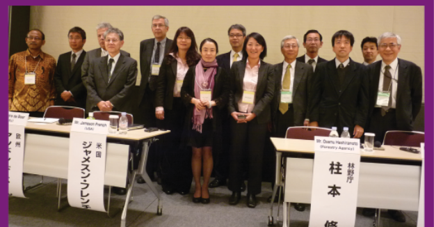
11 November – Group photo of speakers for the International Seminar on Goho-Wood 2012, Yokohama, Japan