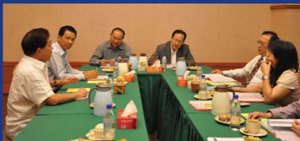
27 August - STA 27 th Management Committee Meeting