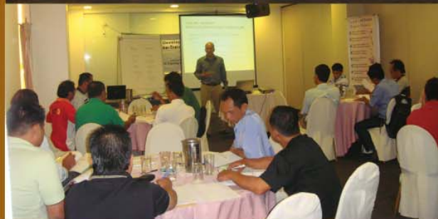
16 to 20 April – STAT: Training Development Programme Train-The-Trainer