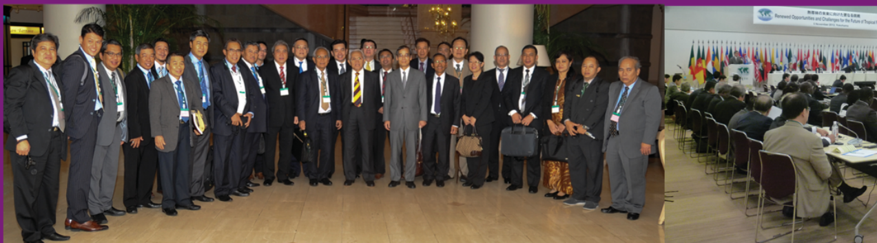
5 to 11 November – 48 th International Tropical Timber Council, Yokohama, Japan