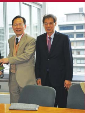
Momento by Dato Secretary to Japan with the Working Group to Japan