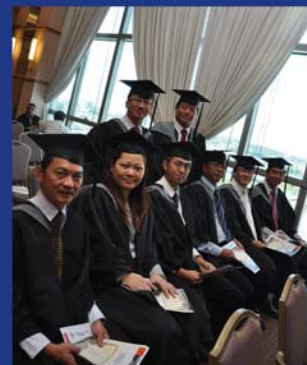
15 February - Memorandum of Understanding Signing Ceremony between STA Training Sdn Bhd & Lincoln University and Postgraduate Diploma Certificate Presentation Ceremony witnessed by Datuk Amar Haji Awang Tengah Ali Hasan the Second Minister of Resource Planning and Environment