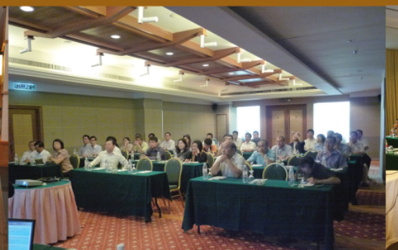
13 to 20 April - Informal Session on Minimum Wage (Kuching)