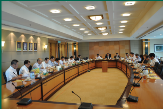
2 March - STA 79 th Council Meeting