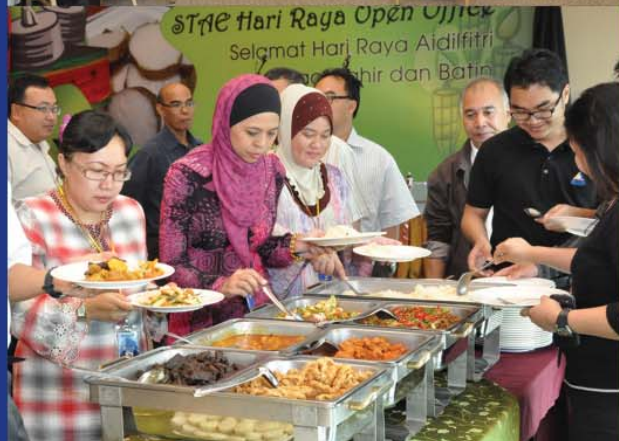
28 August - STAE Hari Raya Open Office