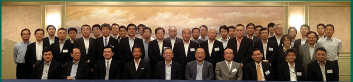
18 September – Tri-Nation Meeting in Tokyo