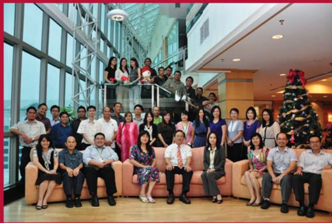
3 January - Staff Christmas and New Year Lunch