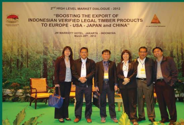
20 March – 2 nd High Level Market Dialogue 2012, Jakarta, Indonesia