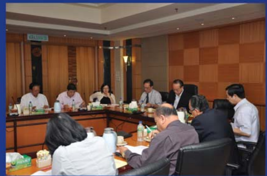
14 February - First STA Mutual Board of Honorary Advisers Meeting