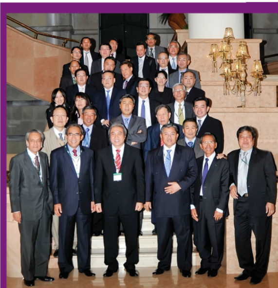
5 November – Closed Door Dialogue Session On Timber Trade between Japan and Sarawak, Yokohama, Japan