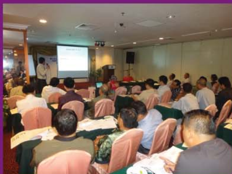
7 to 8 May - Briefing on MC&I (Natural Forest)