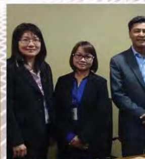
2 August, Presentation