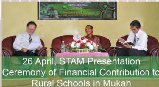
26 April, STAM Presentation Ceremony of Financial Contribution to Rural Schools in Mukah