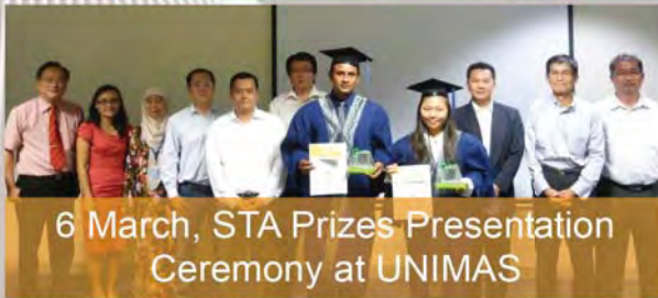
6 March, STA Prizes Presentation Ceremony at UNIMAS