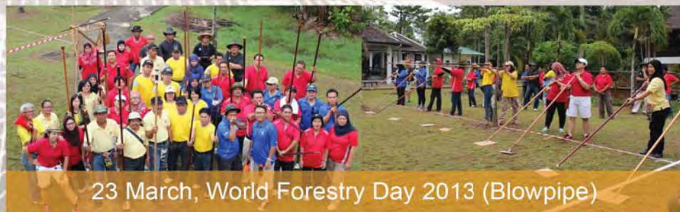
23 March, World Forestry Day 2013 (Blowpipe)