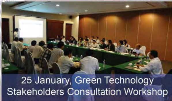
25 January, Green Technology Stakeholders Consultation Workshop