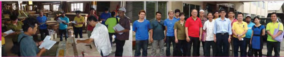
9-10 November, Basic Carpentry Skills Training at Chuan Ming Sdn Bhd