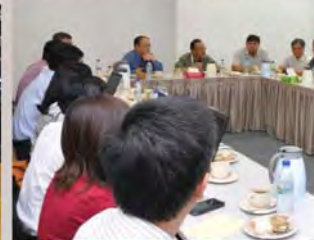
27 March, Dialogo "Plastic-Tag Tag"