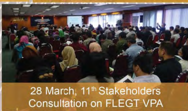
28 March, 11 th Stakeholders Consultation on FLEGT VPA