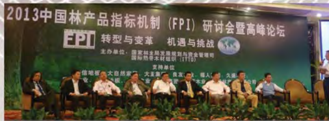
24 October, 2 nd Workshop of the China's FPI