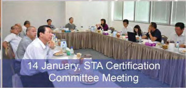
14 January, STA Certification Committee Meeting