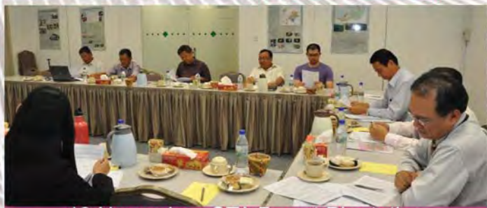
19 November, STA Forest Plantation Committee Meeting