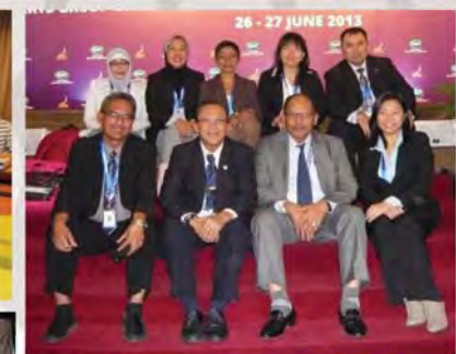
26-27 June, 4 th APEC Expert Group on Illegal Logging and Associated Trade Meeting