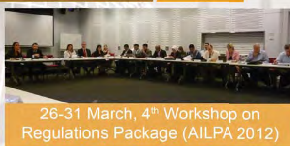
26-31 March, 4 th Workshop on Regulations Package (AILPA 2012)