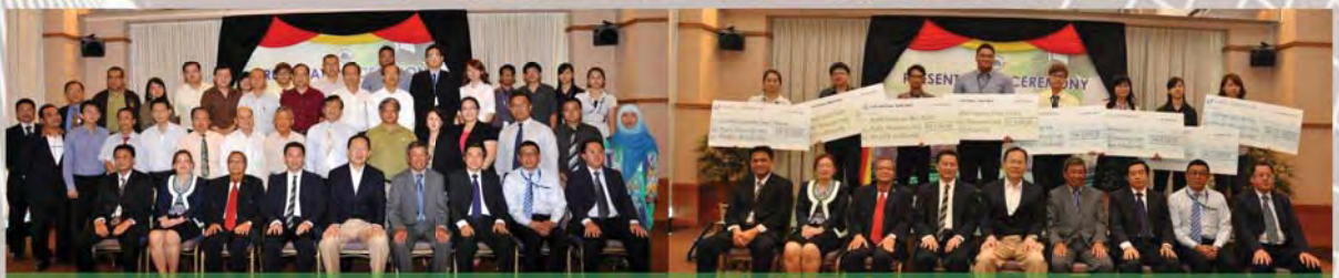
24 April, STAM Financial Contributions & Scholarships Ceremony