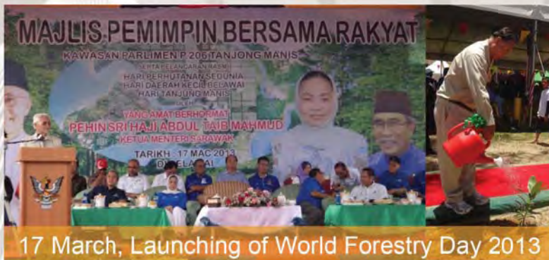
17 March, Launching of World Forestry Day 2013