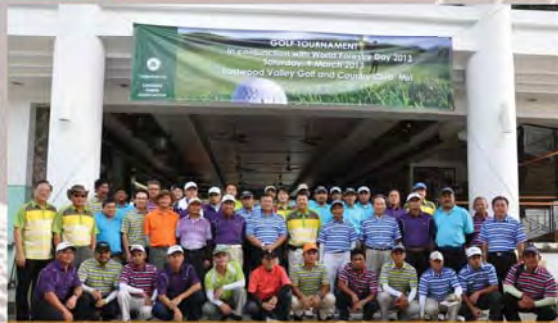
9 March, World Forestry Day 2013