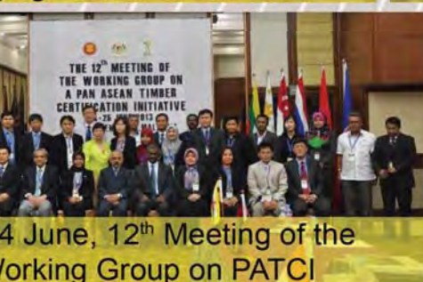
4 June, 12 th Meeting of the Working Group on PATCI