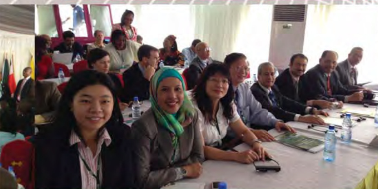
November, 49 th ITTC Meeting