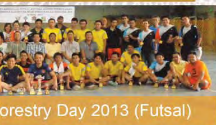
Forestry Day 2013 (Futsal)