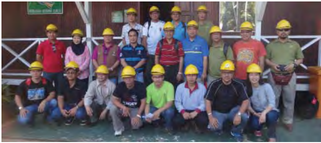
Photo: Group photo