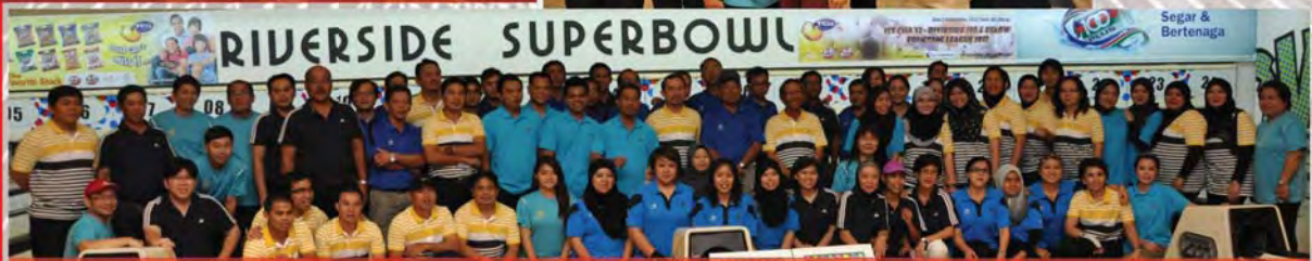
16 February, World Forestry Day 2013 (Bowling)