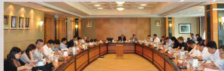
24 September, STA Council Meeting No 2/201