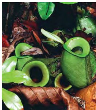
Nepenthes ampullaria Habitat: Peat swamp and Kerangas forests (in shady locations)