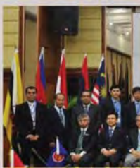
23-24 J Work