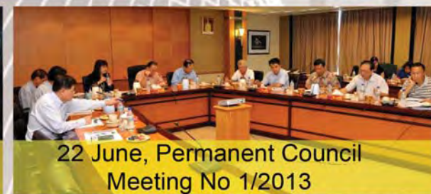
22 June, Permanent Council Meeting No 1/2013