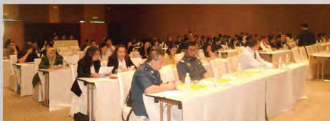
21 November, Seminar on Trade Remedies - Anti Dumping & Safeguards