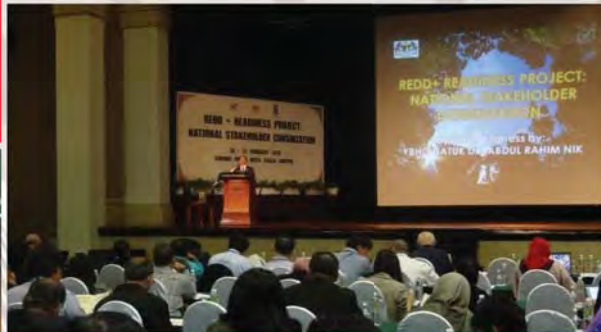
20-21 February, REDD+ Readiness Project