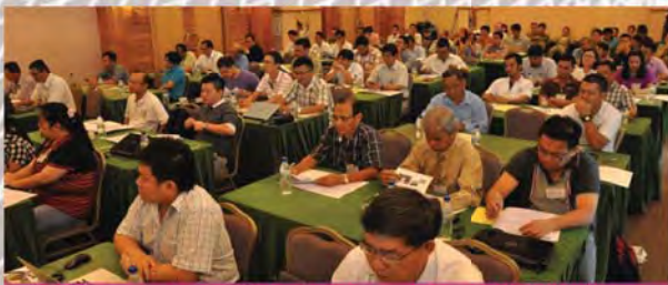
19 November, Seminar on Basic & Working Properties of Planted Acacia mangium