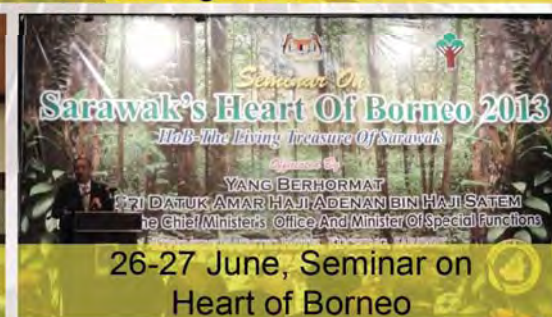
26-27 June, Seminar on Heart of Borneo