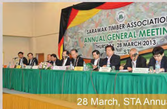
28 March, STA Annual General Meeting