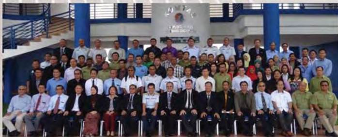
30 October, Inter-Government Agencies Consultation and Capacity Building Seminar 2013