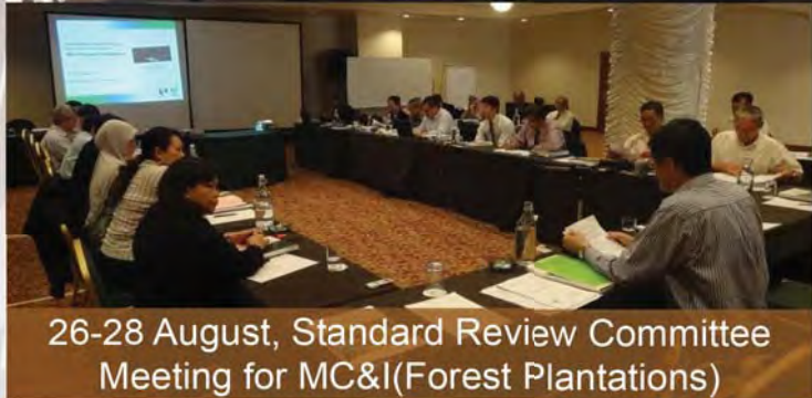
26-28 August, Standard Review Committee Meeting for MC&I(Forest Plantations)