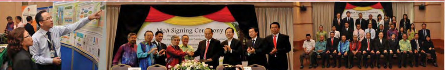
21 February, MoA Signing Ceremony with UNIMAS on Kelampayan Research Project