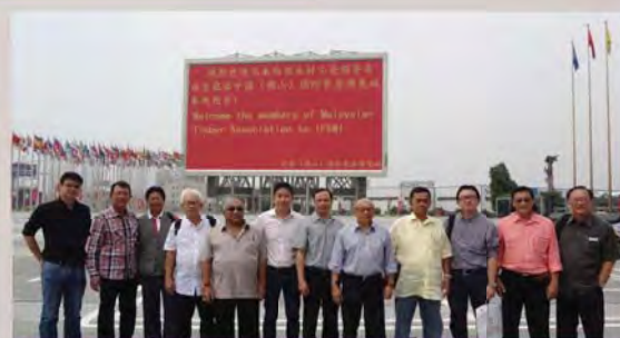
7-12 May, MTA's Study Trip to Guangzhou