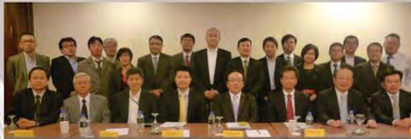
4 October, 16 th Joint Meeting of JPMA / JLIA / APKINDO / STA