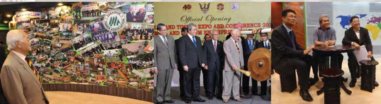
5-10 June, Sarawak Grand Timber Expo 2013