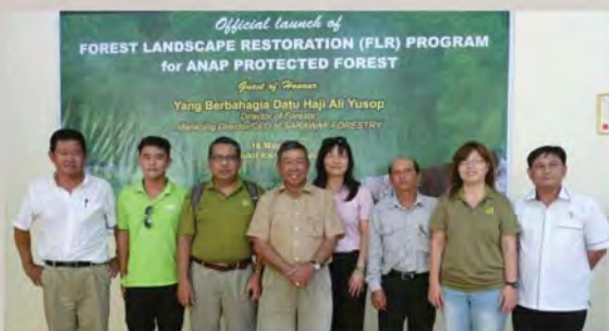
16 May, Launching of Forest Landscape Restoration Program for Anap Protected Forest