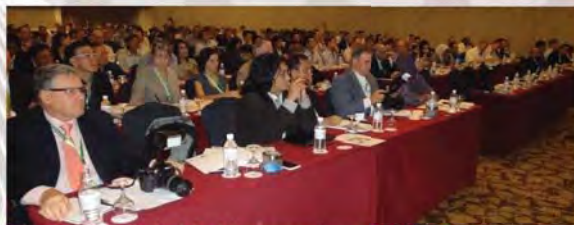
14-15 November, PEFC Stakeholders Dialogue