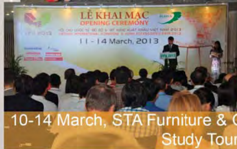
10-14 March, STA Furniture & Other Woodworking Committee's Study Tour to Vietnam