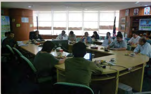
25 September, Meeting with NREB on EIA