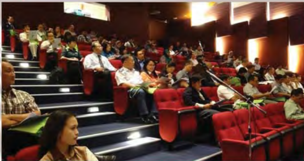
15 July, Roadshow on the Implementation of NRE (Audit) Rules 2008