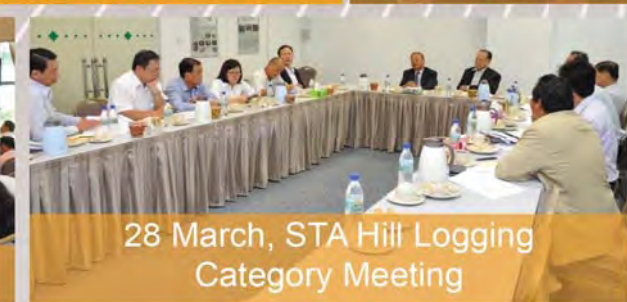
28 March, STA Hill Logging Category Meeting