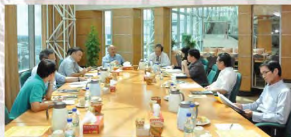
28 November, STA Panel Products Committee Meeting No 2/2013