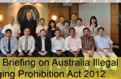
Briefing on Australia Illegal Logging Prohibition Act 2012