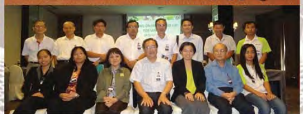
22 & 24 October, Briefings on IUCN Red List for Sarawak