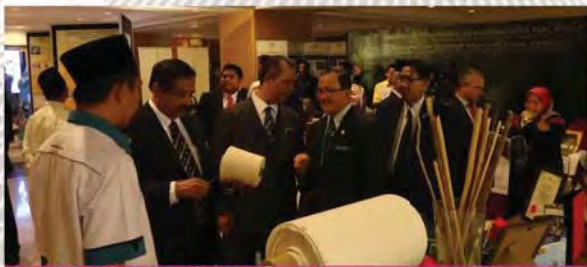
11-12 November, Conference on Forestry and Forest Products Research