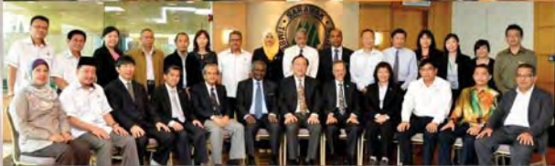
17 October, Follow Up meeting between MPIC and STA on FLEGT VPA