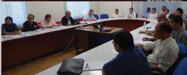
14-15 August, Dialogues on Phytosanitary Matters with DOA