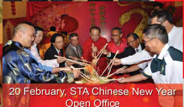
20 February, STA Chinese New Year Open Office