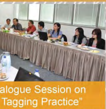
Dialogue Session on Tagging Practice"