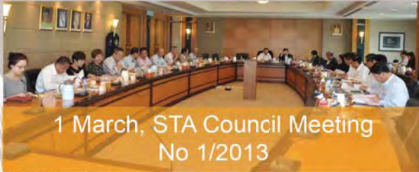
1 March, STA Council Meeting No 1/2013