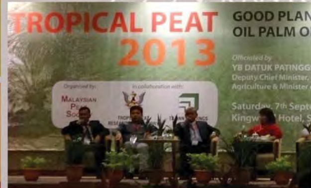
7 September, Workshop on Tropical Peat