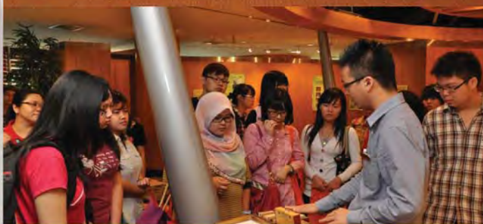
3 September, Kolej Sunway Students Study Visit to STA