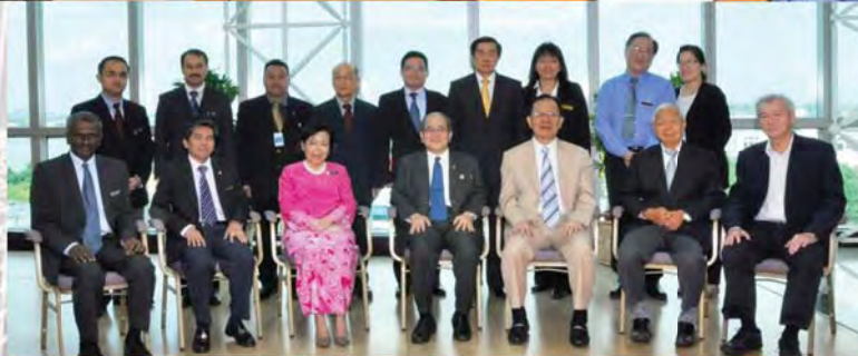
1 August, Working visit of MPIC to STA