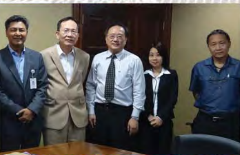
ntation to the Permanent Secretary of MRPE