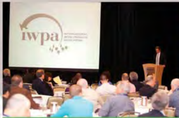
15-22 April, 57 th IWPA Annual Convention