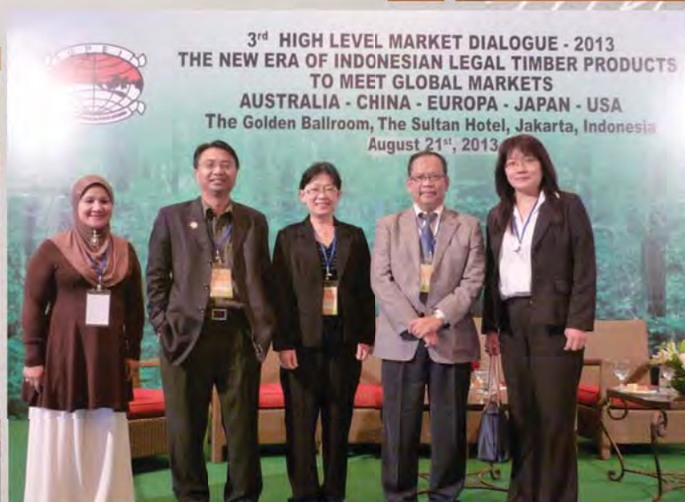
21 August, 3 rd High Level Market Dialogue 2013