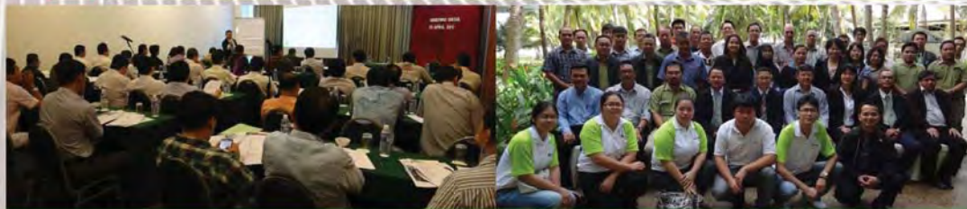
25 & 29 April, EIA Briefing