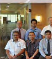
6 June, Br Logging