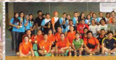
16 March, World Fore