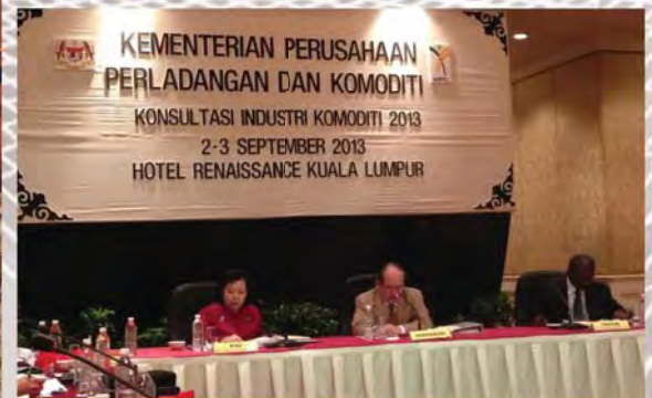
3 September, MPIC Industry Commodities Consultative Session