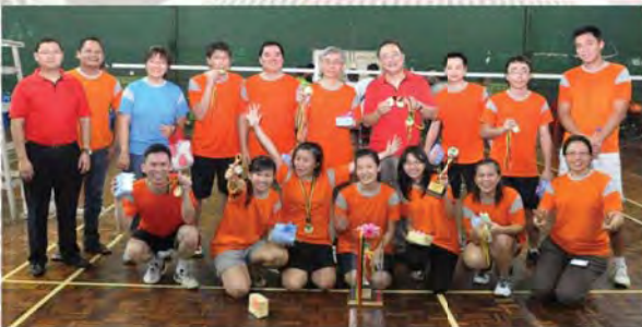
22-23 February, World Forestry Day 2013 (Badminton)