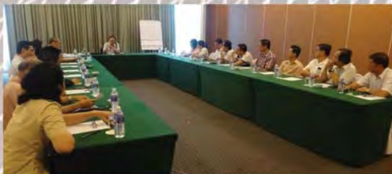
22 August, Meeting on Phytosanitary Matters