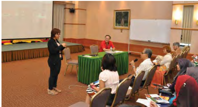
Photo: Talk in progress

the population of Rafflesia at Naha Jaley, species identification, habitat description, population and habitat threats, proposed conservation strategy as well as the benefit to the communities and other stakeholders.