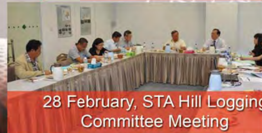
28 February, STA Hill Logging Committee Meeting