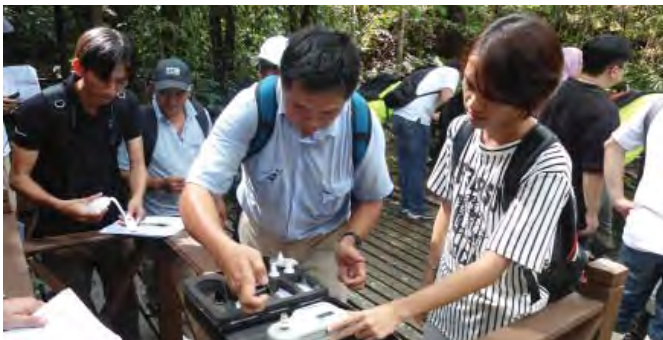
Photo: Students trying out the instrument to determine the turbidity of the sample collected

The topics which were covered in this subject included the Introduction to Biodiversity Values; High Conservation Value Forest (HCVF) concept; A Wildlife Masterplan for Sarawak; General Environmental Monitoring Protocols; and Specific Monitoring Techniques for Water Quality, Birds, Mammals, Herpetofauna, Macro-invertebrates and Fish.