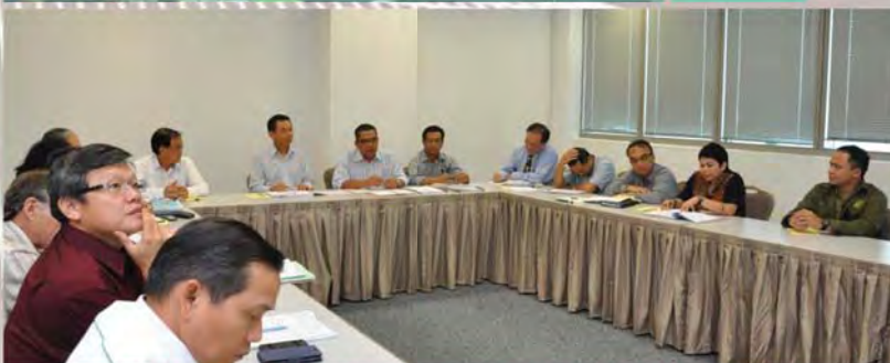
30 July, Working Committee Meeting on SOP for Harvesting Forest Plantation and Royalty Assessment