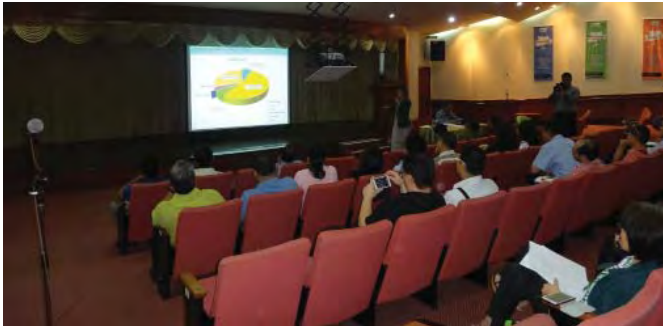
Photo: Briefing in progress

The Sarawak Timber Industry Development Corporation (STIDC) held a Briefing on the Draft Country Specific Guideline (CSG) for Sarawak on 20 December 2013 at Wisma Sumber Alam, Kuching. The objective of the Briefing was to inform and gather inputs from exporters on the draft CSG, which is being developed between the Malaysian and the Australian Governments. Approximately thirty five (35) representatives from the State forestry agencies, timber exporters and the Secretariat of Sarawak Timber Association (STA) were in attendance.