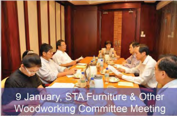
9 January, STA Furniture & Other Woodworking Committee Meeting