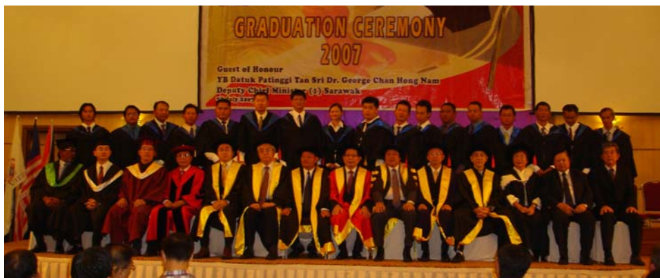
Picture: Students who had completed the Course

Pada Jun 2006, Jabatan Hutan Sarawak, Sarawak Forestry Corporation, Institut Teknologi Riam dan STA bersama-sama menawarkan kursus ini. Pada 7 Julai 2007, 19 orang pelajar telah diberi Sijil dalam satu Majlis Penyampaian Ijazah.