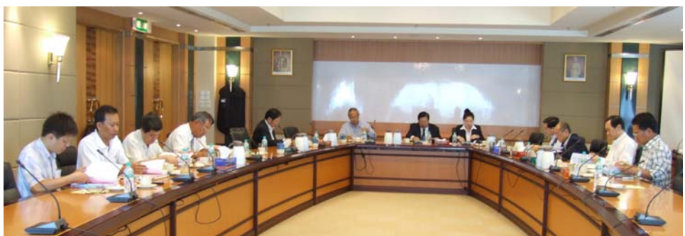
Picture: Meeting in progress