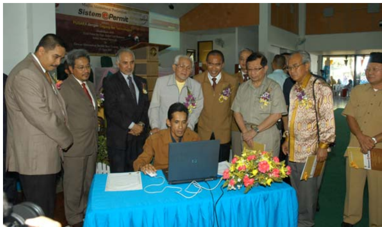
Picture: Demonstration of the ePermit system

STIDC is the pioneering agency in Sarawak implementing ePermit system for import and export of timber and timber products. This system has been on trial run since November 2006 and will process approximately 30,000 permit applications annually. ❁