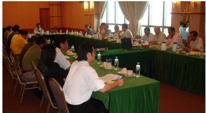
Picture: Meeting in progress

At the Meeting, it was resolved to invite the assessors of the Malaysian Timber Certification Council to guide the FMU representatives through the requirements of the Malaysian Criteria and Indicators (MC&I) 2002. It was proposed that this briefing session be held at Wisma STA on 20 September 2007. ❁