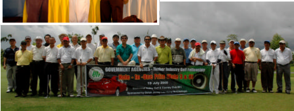
Below: Group photo of the participants