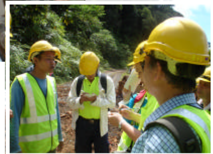
Right: Students interviewing the tractor driver after the demonstration