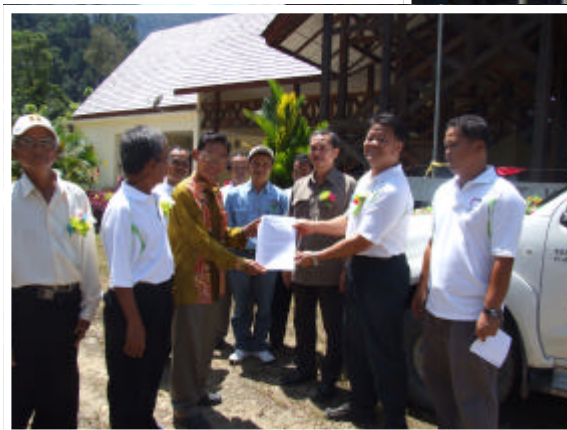
Left: Handing over ceremony