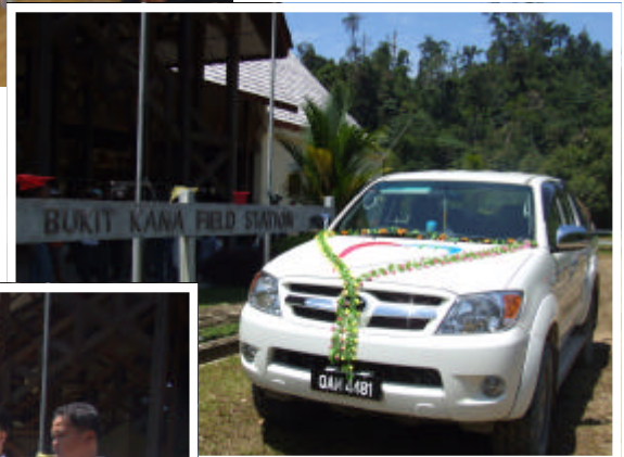
Right: The Toyota Hilux 4x4 double cab pickup truck