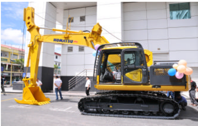
Left: The PC200-7 Komatsu Swing Yarder on show