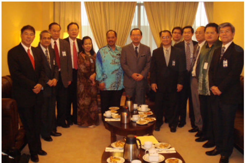
Picture: Group photo after the meeting