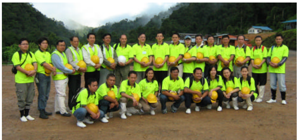
Below: Group photo at base camp