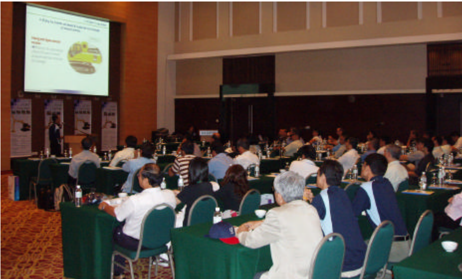
Above: Participants at the Seminar

UMW (East Malaysia) Sdn Bhd dan Komatsu Asia Pacific Pte Ltd, dengan kerjasama dari STA, telah bersama-sama menganjurkan seminar sehari tentang "Swing Yarder" dan "Log Yarder" Komatsu bertujuan untuk mengurangkan impak pembalakan pada 20 Ogos 2008 di Sibu. Seminar ini dihadiri oleh lebih kurang 200 orang peserta terdiri dari peneraju industri pembalakan, ahli-ahli STA, dan kakitangan agensi kerajaan, urusetia STA dan UMW dan Komatsu.