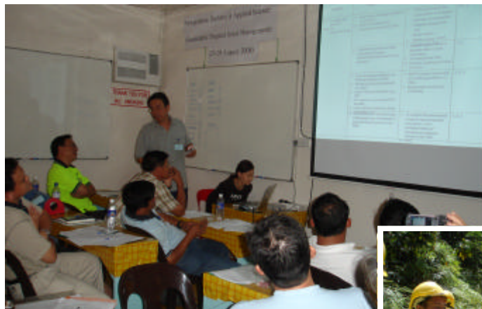
Left: Class presentation by the students

For field visits, the students were brought to various blocks in the forest management unit for practical sessions. The practical sessions exposed the students to procedures of assessment carried out by assessors during the certification process. There was also a demonstration on Reduced Impact Logging. 🌱