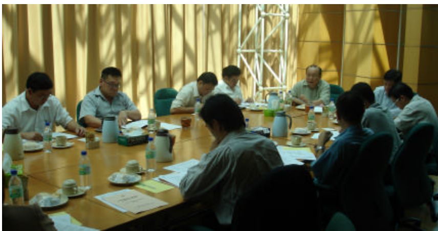
Picture: Meeting in progress

The meeting discussed matters related to EN636, data and statistics on plywood trade and export and the current log situation. There was also an exchange of information on the markets in the various regions. ❁