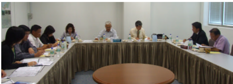
Picture: Meeting in progress

The meeting discussed the harvesting of planted forests, cess for harvested timber, chain of custody, training of forest plantation personnel and the draft Malaysian Criteria and Indicators for Forest Plantations. ❁