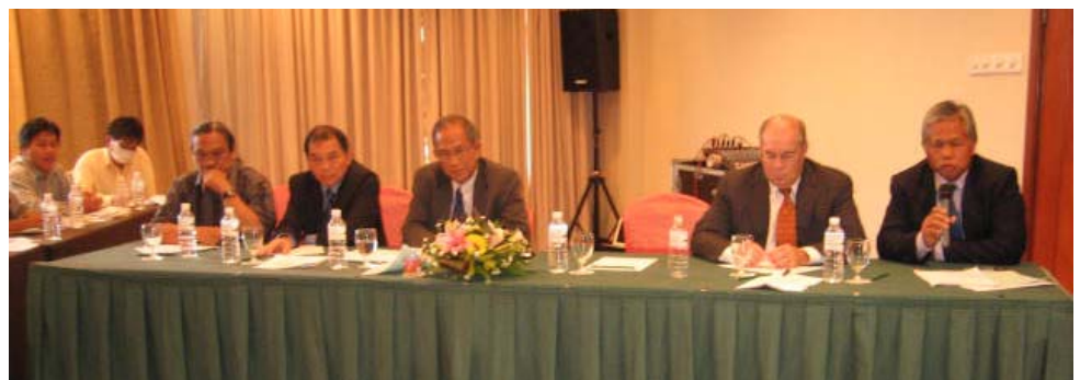
Questions and Answer session.