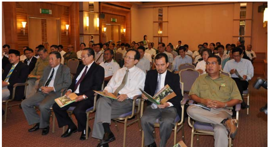
The turnout at the Seminar