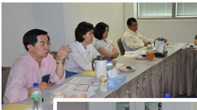
Left & Below: Members at the meeting

Satu taklimat telah diberikan kepada Syarikat Kecil dan Sederhana ahli STA pada 7 Ogos 2009 di Wisma STA, Kuching. Taklimat ini membincangkan hal-hal berkaitan dengan pelaksanaan Memorandum Latihan Pekerja-pekerja Terlatih di bawah Seksyen 54B Ordinan Hutan (Sarawak Bab. 126). Tujuan taklimat ini adalah untuk mendapatkan pandangan Ahli-ahli tentang cadangan untuk mempercepatkan program latihan.