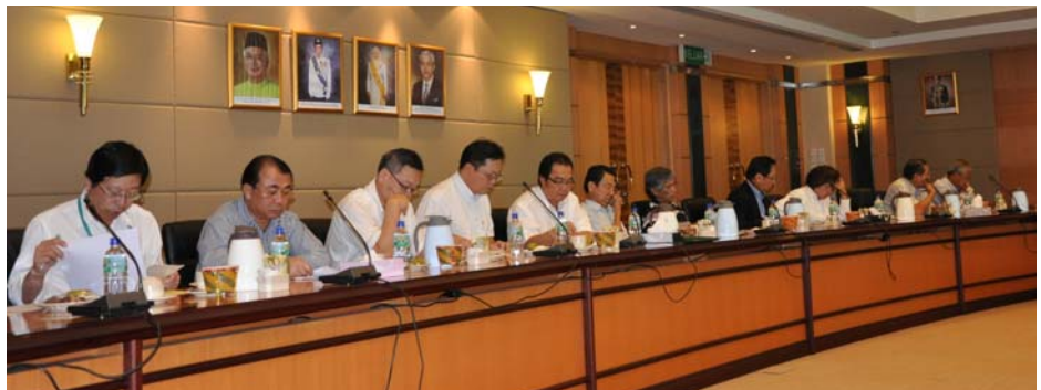
Below: Members of the Hill Logging Category