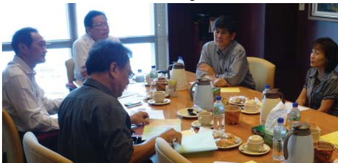
Photo: Meeting in progress

The Meeting also identified suitable training and discussed training requirements for workers in the furniture and other woodworking industry while exploring ways for the Association to fund these training.