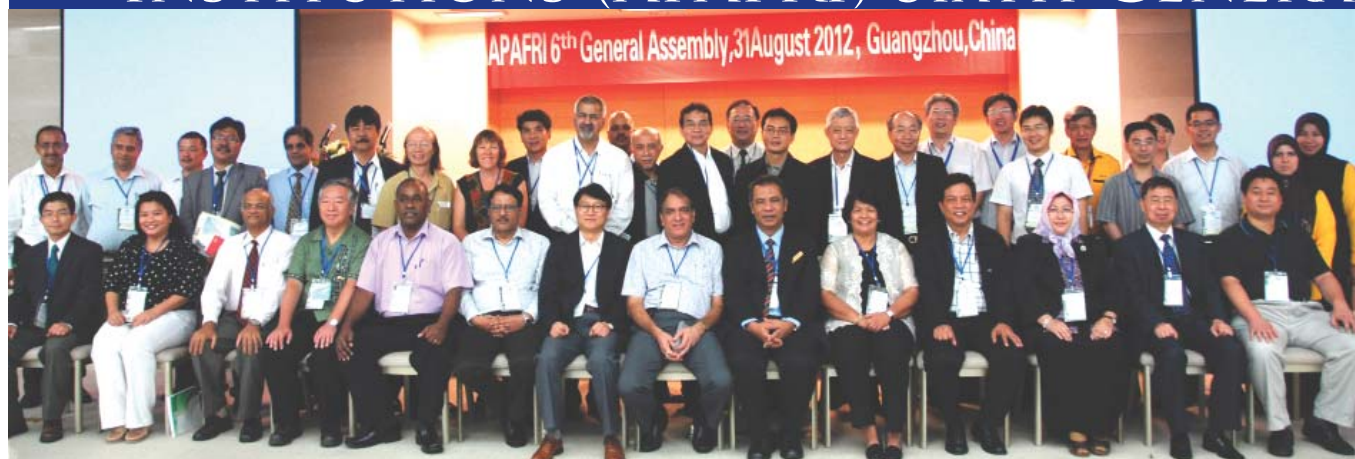
Photo: Group photo

The Asia Pacific Association of Forestry Research Institutions (APAFRI) is an independent non-profit body, which aims to enhance research and technology development capabilities in support of conservation and management of forest resources in the Asia-Pacific region. The Secretariat is based in the campus of Forest Research Institute of Malaysia (FRIM), Kuala Lumpur, Malaysia.