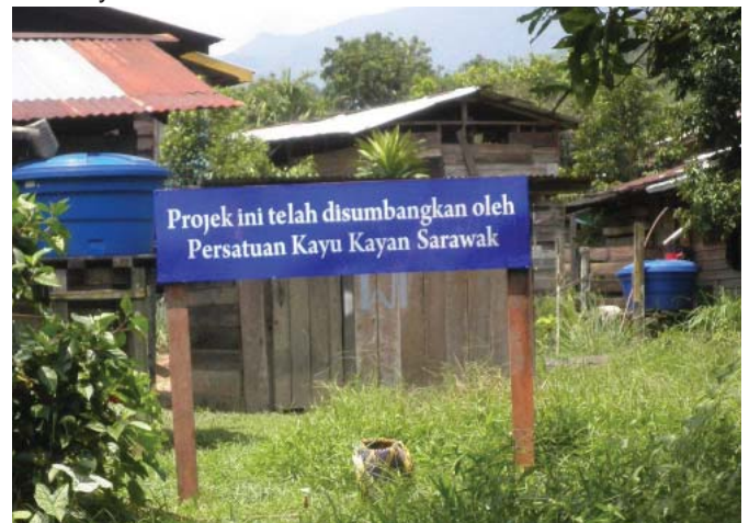
Photo: Water Tank Project

The Penan communities in Long Lamai (450 people) and Long Sait (400 people) have benefited from these two projects. Long Lamai is located close to the international border between Kalimantan, Indonesia and Sarawak, Malaysia. The only way to get to Long Lamai is by an hour boat ride from Long Banga, Baram, where the nearest rural air service airport is located. The only way to get to Long Sait is a 7-hour drive through of logging road from Miri, followed by a 3- to 4-hour boat ride. Sometimes one has to walk halfway the journey on the boat ride due to the low level of the river. This village has difficulty to locate a water source for a gravity-feed system to get water supply for daily use.