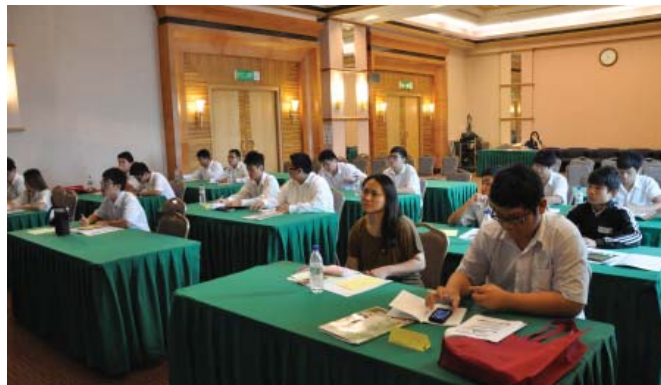
Photo: Briefing in progress