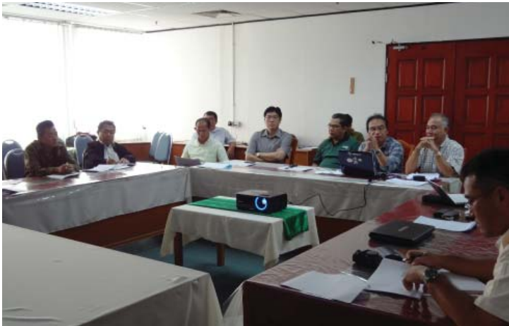
Photo: Discussion in progress