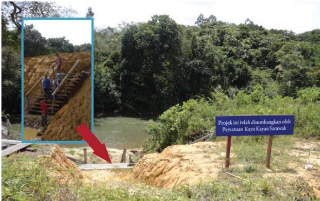
Photo: Landing Stage Project

STA in collaboration with the Sarawak Forestry Corporation (SFC) had conducted a fact-finding mission in Apoh-Tutoh, Upper Belaga and Upper Baram from March to May 2010, to gather information that would enable STA and its members to implement projects that would benefit communities living in the vicinity of their timber licence areas.