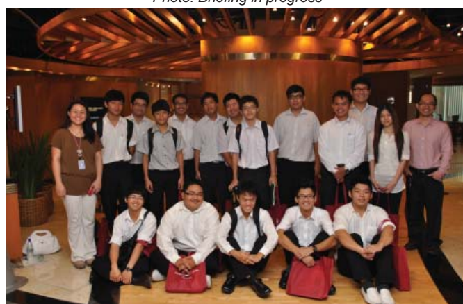
Photo: Group photo

Persatuan Kayu Kayan Sarawak (STA) telah menganjurkan lawatan sambil belajar untuk enam belas (16) orang pelajar di Wisma STA pada 9 Ogos 2012. Lawatan tersebut adalah sebahagian daripada program orientasi seminggu bagi pelajar yang telah dipilih oleh Kumpulan Syarikat KTS untuk "Program Pembangunan Potensi Muda bagi Pengurusan Perladangan". Setelah tamat program ini, pelajar-pelajar ini akan ditawarkan pekerjaan di ladang kelapa sawit KTS.