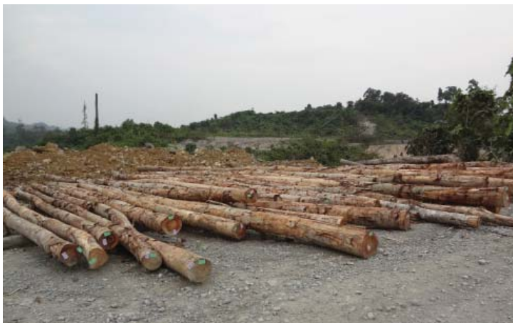
Photo: The Paraserianthes falcataria logs

The Sustainable Forestry and Compliance Unit of Sarawak Forestry Corporation (SFC) recently carried out an exercise to field verify the results of the study for weight scaling of logs harvested from planted Paraserianthes falcataria forests. Representatives from the Applied Forest Science & Industry Development Unit, SFC; Forest Plantation & Reforestation Division of Forest Department Sarawak; Sarawak Timber Association and Shin Yang Forestry Sdn Bhd participated in this exercise, which was carried out in Long Lama, Miri on 6 August 2012.