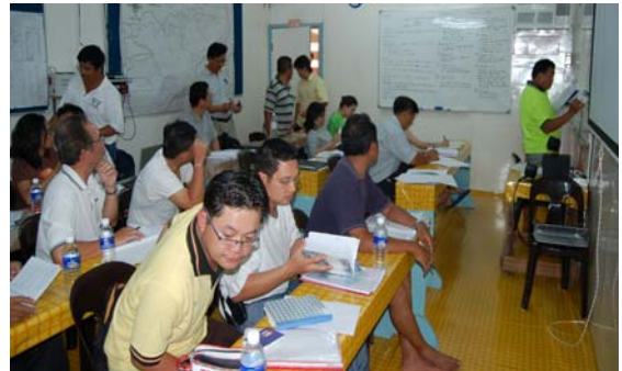
Picture: (left) Field demonstration of logfisher and (top) Having lessons in classroom