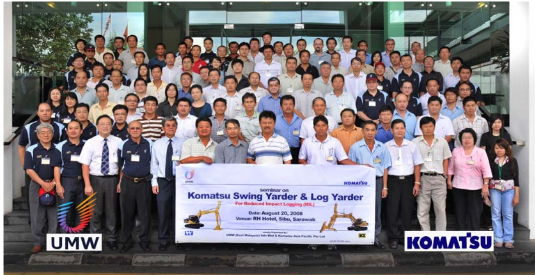
Picture: Group photo of the participants

A one-day Seminar on Komatsu Swing Yarder and Log Yarder for Reduced Impact Logging was jointly organised by UMW (East Malaysia) Sdn Bhd and Komatsu Asia Pacific Pte Ltd (KAP), with assistance from STA. This Seminar was attended by about 200 STA members and staff, relevant Government agencies, the STA Secretariat and UMW.