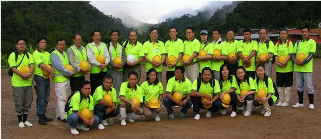
Picture: Group photo of the first batch students with lecturer and FMU staff

The first batch of students of the Postgraduate Diploma in Applied Science (Sustainable Tropical Forest Management) attended their last Module on "Sustainability – Theory and Practice" at the Melatai Camp, Putai