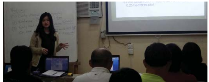
Photo: Student presentation

The subject was delivered in two (2) parts; four (4) days classroom-style lectures and one (1) day field trip. The main purpose of this subject was to introduce RIL in the context of sustainable forestry in Sarawak. This included planning of RIL operations in terms of pre-harvest assessment and post-harvest assessment. The lecture was held at the Base Camp, Melatai FMU and the field trip was conducted at selected sample plots within the FMU where the students and participant were required to do a pre-harvest assessment using 50x50m (0.25ha) sample and a post-harvest assessment inventory using the Silvicultural Management Inventory (SMI) system. Students had a better understanding of the classification of trees, were able to conduct silvicultural mapping to provide an overall view of the continuity of the forest canopy and to identify the closure of the area using canopy closure classes as well as to work out yield projections of the forests on a 25-year and 40-year cycle.