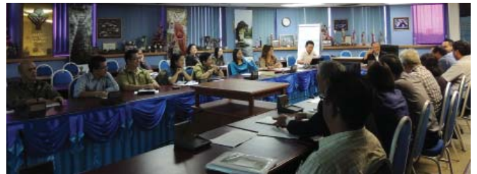
Photo: TWG ASDU Meeting in progress

The FLR project is getting support from relevant agencies such as Harwood Timber Sdn Bhd to contribute rubber seedlings, while Zedtee Sdn Bhd and STA are donating RM30,000 and RM10,000 respectively for the project.