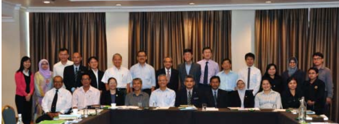
Photo: Group photo of members, alternate members and observers for the SRC Meeting (Photo courtesy of MTCC)

The Malaysian Criteria and Indicators for Forest Management Certification (Forest Plantations) [MC&I (Forest Plantations)] which is the standard for assessing the management practices of forest plantations under the Malaysian Timber Certification Scheme (MTCS), was due for the first review in 2013. In line with the requirements specified in the MTCS document SSP2/2012: Rules on Standard Setting Process for Development of Timber Certification Standards, the main body which will be responsible for the review of the MC&I (Forest Plantations) is the Standards Review Committee (SRC).