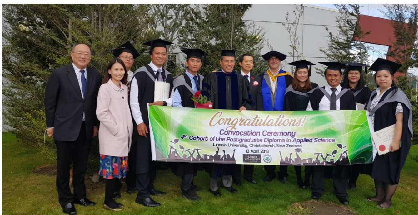
Group photo with the graduands

The programme is an important contribution to the State Government's drive towards a properly trained workforce at supervisory and management levels to ensure that forests are managed sustainably, efficiently and effectively.