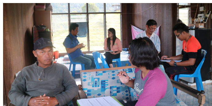
High Conservation Value (HCV) and Social Impact Assessment (SIA) in Long Sukang, Lawas

The first batch of the Programme commenced in April 2017 with fifteen (15) interns who were selected from applicants through a series of interviews and screening. Renowned experts from various international and local institutions and organisations were invited to impart onto the interns understanding and knowledge on biodiversity, policies and regulations governing the forestry and timber industry in the State as well as hands-on experience on subjects pertaining to FMC, i.e. High Conservation Value Area (HCVA) and Reduced Impact Logging (RIL).