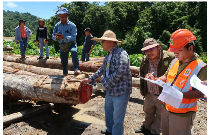
Measurements taken at Ng Lajan Logpond, Song