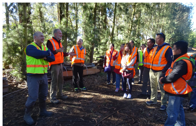
Visit to John Fairweather Specialty Timber Solutions, North Canterbury

were amongst the significant matters that were discussed during the visit.