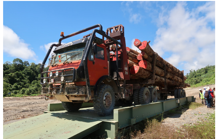
Weighing the logs using weighbridge

Wood disc samples were collected at both ends and at every 6m interval from six (6) randomly selected full-length logs. These disc samples were transported to Timber Technology Centre (TTC), Applied Forest Science & Industry Development Division (AFSID) of SFC for laboratory testing to determine the conversion factor which will be compared to the factor derived by weight bridge and scaling method.