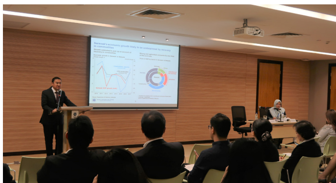
Briefing in progress

Bank Negara Malaysia (BNM) organised a Briefing on Bank Negara Malaysia Annual Report 2017 on 11 April 2018 at BNM office in Kuching. Approximately 100 representatives from the financial institutions, private sectors and trade associations attended this Briefing which was organised for the fourth time in Kuching.