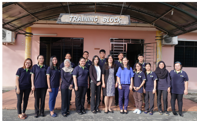
Representatives from STA flanked by interns of the second batch of CIP for FMC