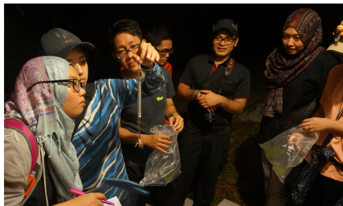
Interns participate in a frog survey in Kubah National Park

In recognising that capacity building is an integral part of the implementation of the policy, SARAWAK FORESTRY Corporation (SFC) and Sarawak Timber Association (STA) have jointly organised the Conservation Internship Programme (CIP) for Forest Management Certification (FMC) which rides on the Research for Intensified Management of Bio-Rich Areas (RIMBA) of Sarawak platform.