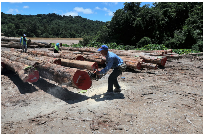
Cutting a disc sample from the end of the log

本会连同砂拉越森林企业机构(SFC)及砂拉越森林局(FDS)于2018年4月16日至18日假桑坡县为黄梁木重量转为体积因子研究进行重新评估。这项研究是为了验证去年所获得的黄梁木重量转为体积因子。