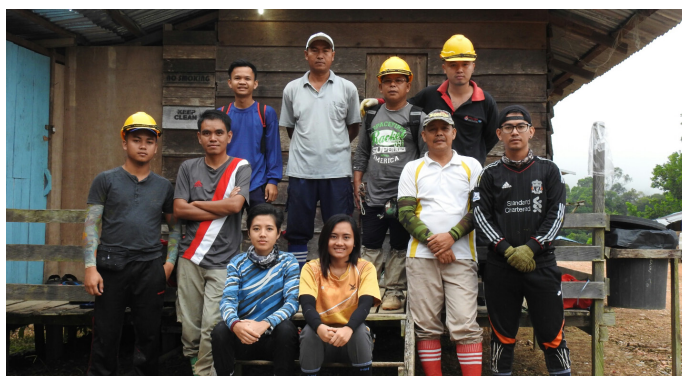
Interns at Kapit FMU for the conduct of PSP modules

An Opening Ceremony of the Second Batch of CIP for FMC was successfully held on 16 April 2018 at SFC's