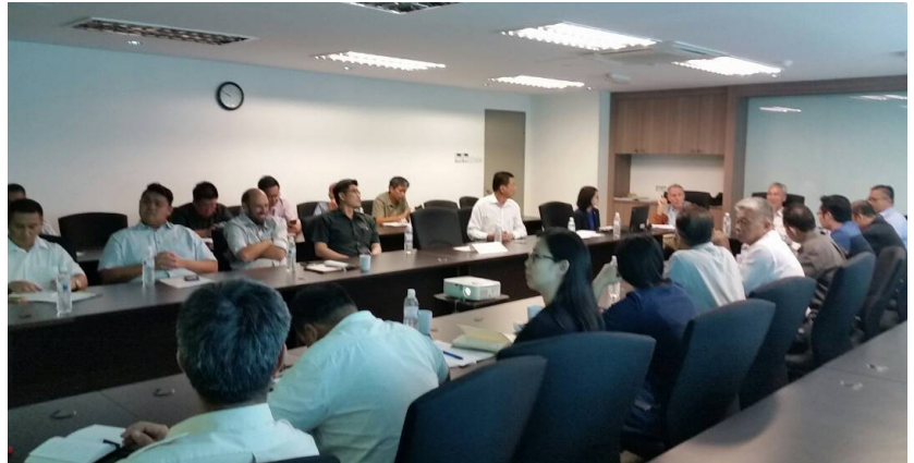
Meeting at Miri