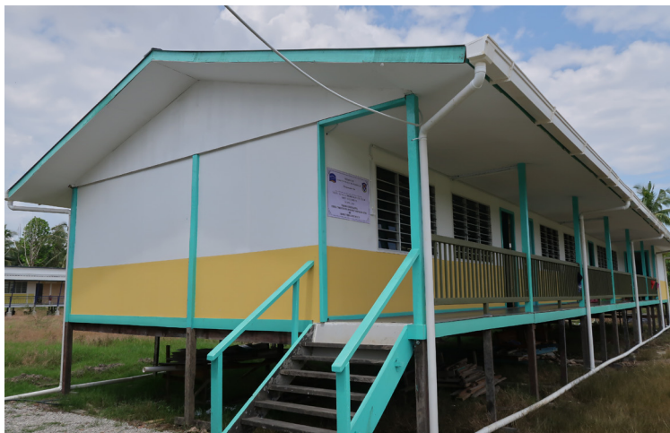
The new temporarily pre-school building to re-locate the 14 pre-school students of SK Kampung Buda

Mr Kon in his welcoming remarks informed those present at the Ceremony that the temporarily pre-school building will also be used as a resource center for the students to do their extracurricular activities and any other official function(s) of the school.