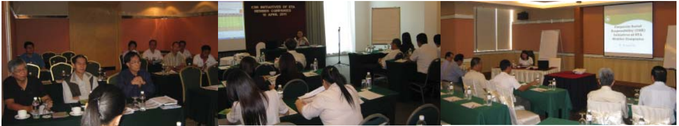
Photo: Roadshow in Miri, Sibul and Bintulu (from left to right)

The Sarawak Timber Association (STA) is carrying out a six-month exercise on the collation of information pertaining to the Corporate Social Responsibility (CSR) initiatives of STA member companies. The objective of this exercise is to identify and document the CSR initiatives of STA member companies. The CSR exercise is expected to be completed by the end of September 2011.