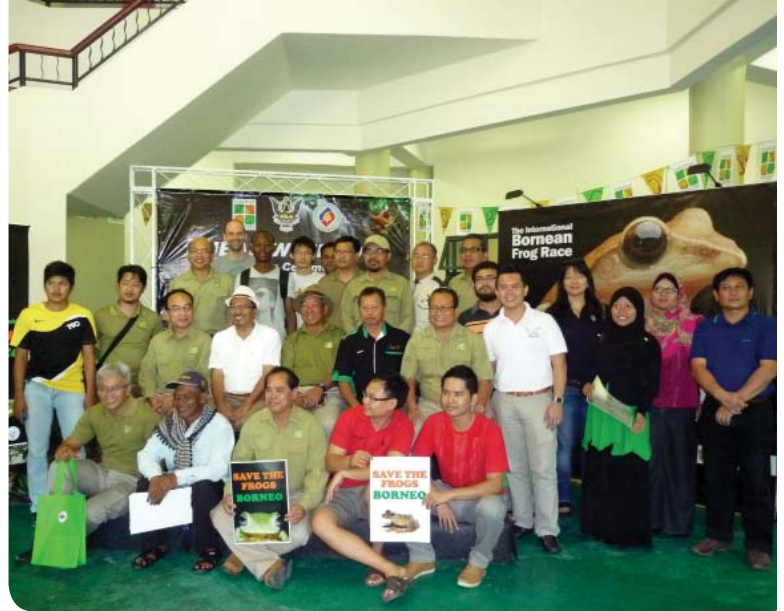
Photo: Group Photo

In conjunction with the Visit Malaysia Year 2014, Sarawak Forestry Corporation (SFC), Universiti Malaysia Sarawak (UNIMAS), Tourism Ministry, the Sarawak Tourism Board and Kuching Resident's Office jointly organised the Kubah Week from 19 to 27 April 2014 to promote Kubah National Park and to highlight Sarawak's conservation activities.