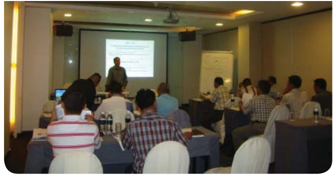
Photo: Course in Progress

Sarawak Timber Association (STA) through its subsidiary company, STA Training Sdn Bhd (STAT) organised another Trainer Development Programme: Trainer Refresher Course from 7 to 11 April 2014 at Tanahmas Hotel, Sibü.