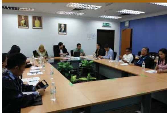
Photo: Briefing in Progress

Kementerian Perdagangan Antarabangsa dan Industri (MITI) Wilayah Sarawak telah menganjurkan Taklimat mengenai Komuniti Ekonomi ASEAN (AEC) 2015 pada 17 April 2014 di pejabat MITI, Kuching.