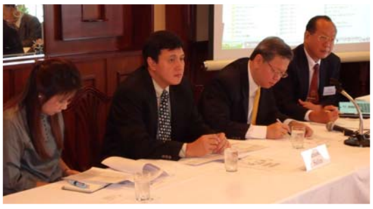
Left: The delegation from APKINDO