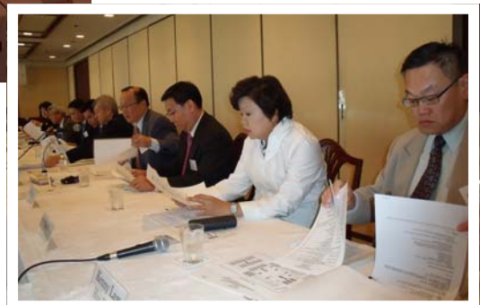
Right: The delegation from JPMA