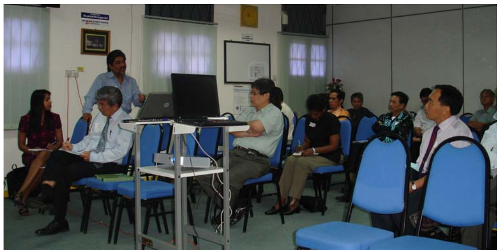
Discussing and explaining the roles and functions of the Regional Working Group among the participants

At the meeting, participants sought clarifications on various issues related to certification and FSC. A representative from each chamber was elected to represent Sarawak at the national level. ❁