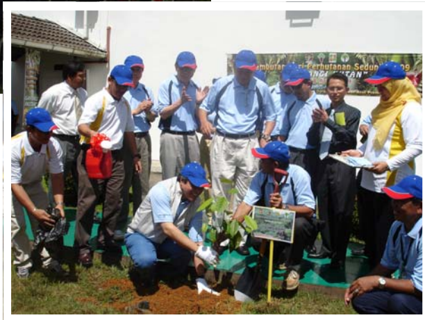
Right: Tree planting by the Minister to mark World Forestry Day