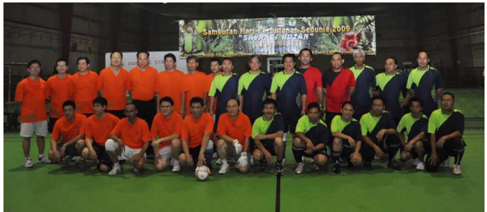
Above: Players from STA and the four agencies with the Chairman, the Honorary Secretary and the Honorary Treasurer of STA

Harwood Timber Sdn Bhd) and STA on 15 April 2009 in Kuching. The game was to foster closer working relationship between the four agencies and STA. STA Team was comprised representatives from member companies. The Game was won by the agencies. 🌸