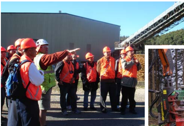
Above: Visit to a mill