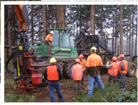
Below: Visit to a plantation to observe harvesting operation