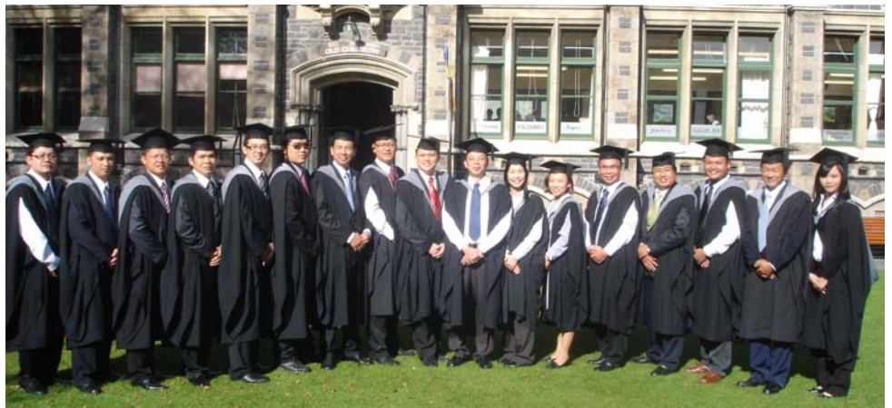
Above: The graduates in front of the Art Centre, Christchurch Below: The Graduation Ceremony at the Town Hall