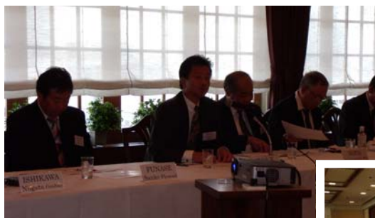
Left: The delegation from Malaysia comprising MPMA and STA members