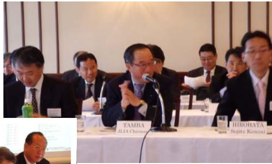
Right: The delegation from JLIA