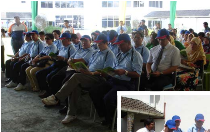
Left: Invited guests at the launching

More than 300 people of various agencies attended the launching of World Forestry Day, marked with planting of trees by the Minister and VIPs. 🌳