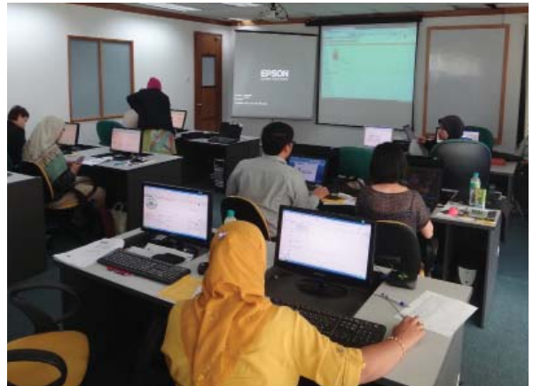
Photo: Briefing in progress

Lembaga Perindustrian Kayu Malaysia (MTIB) telah menganjurkan bengkel portal malaysianwood.net pada 5 April 2012 di Menara PGRM, Kuala Lumpur. Objektif bengkel ini adalah untuk mempromosikan portal malaysianwood.net, bagi menggalakkan industri untuk mendaftar dengan MTIB untuk portal perniagaan ini dan memberi peluang kepada agensi-agensi berkaitan untuk mendapatkan pengalaman secara langsung di portal ini.