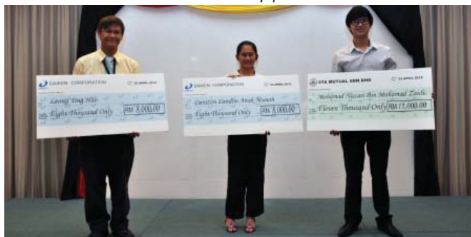
Photo: Scholarships recipients