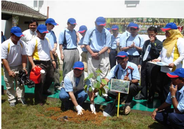
Picture: Tree Planting by the Minister