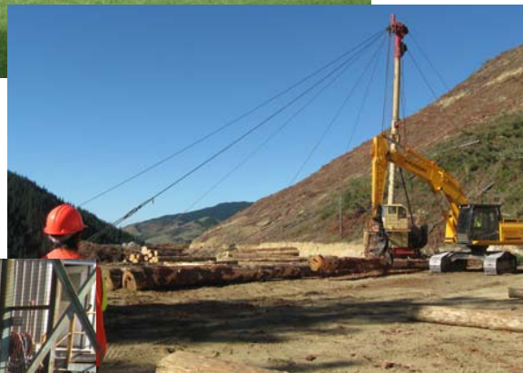
Photo: (top) Visit to Cable system site and (left) visit to a mill