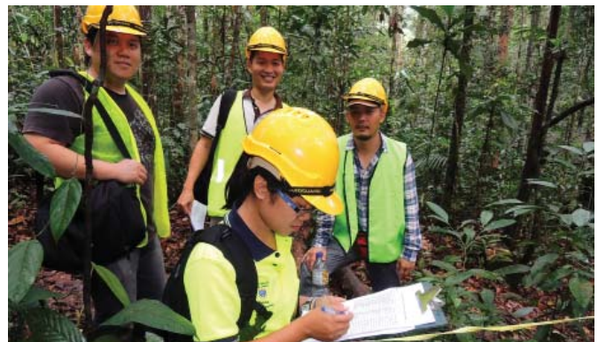
Photo: Recording of Plot Measurement and Identifying Potential Crop Trees

The topics included in this subject cover basic wood structure and anatomy, log identification, log volume measurement and calculation, log grading rules in Sarawak and wood processing.