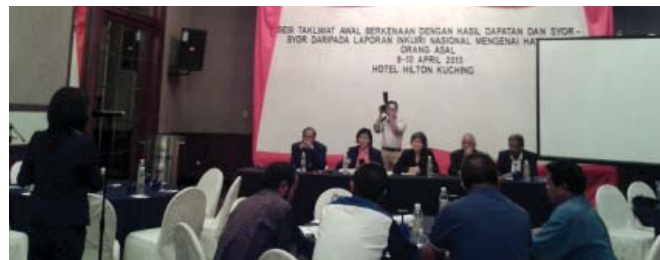
Photo: Briefing in Progress