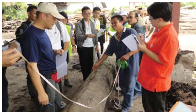
Photo: Students Being Briefed on Log Measuring Process