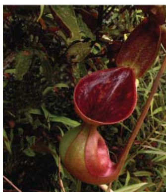
Nepenthes lowii (upper pitcher) Habitat: Mossy montane forests