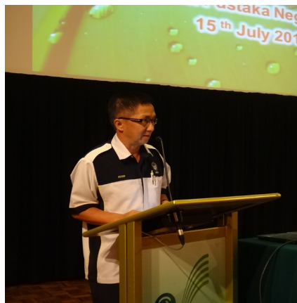
Photo: Mr Peter Sawal, Controller of Environmental Quality Sarawak giving his opening remarks

A Roadshow on the Implementation of the Natural Resources and Environment (NRE) (Audit) Rules, 2008 was organised by the Natural Resources and Environment Board (NREB) on 15 July 2013 at the auditorium of the State Library in Kuching. The objectives of the Roadshow were to inform the participants on the NRE (Audit) Rules, 2008 and to create awareness on the implementation and guidelines of the NRE (Audit) Rules, 2008. Approximately one hundred (100) participants from various government agencies, Environmental Consultancy, private sectors and related stakeholders attended the Roadshow.