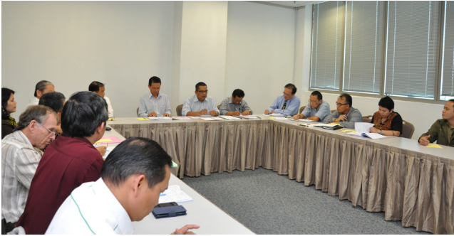
Photo: Meeting in progress